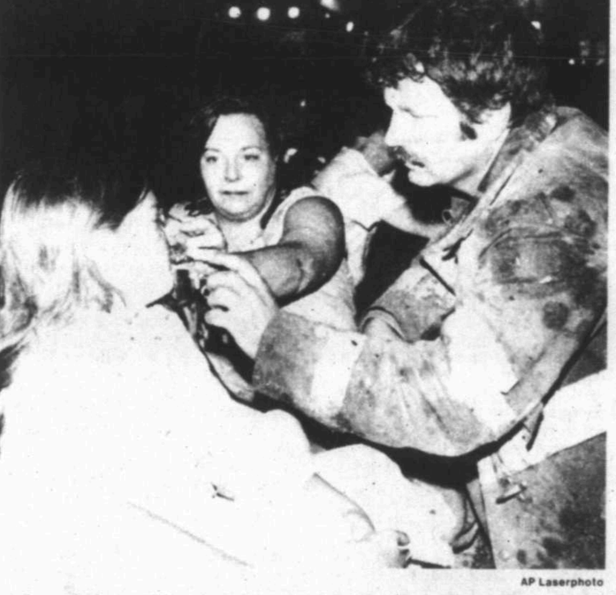
One of about 150 guests evacuated from a Fort Worth Ramada in is treated for smoke inhalation by a Fort Worth firefighter. Guests were evacuated when the early-morning fire erupted. At least five persons died.