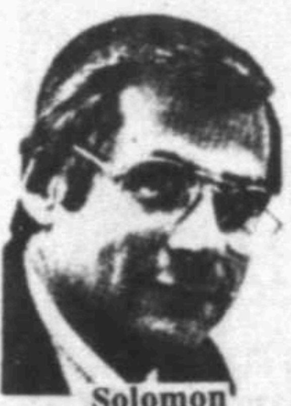
NEIL SOLOMON, M.D.

Universal's "Psycho II," playing at 1,488 theaters, grossed $4.9 million during its second weekend in release. The film has brought in $16.7 million in 10 days.