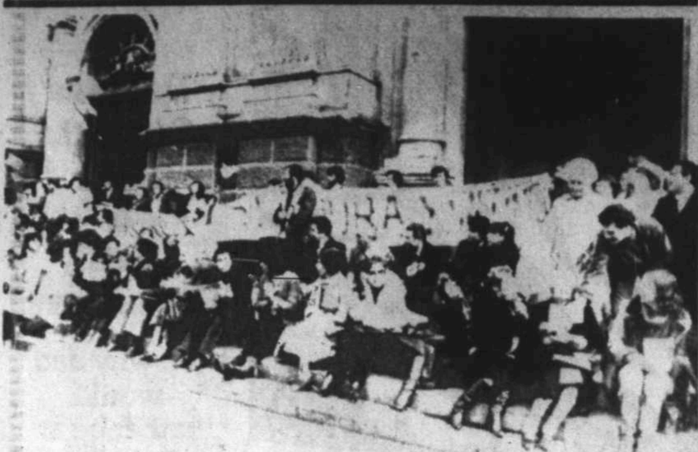
Opponents of Chile's right-wing military junta hold a protest Monday at Santiago's Roman Catholic cathedral. The banner reads "Democracy, Yes—Not ans forever."