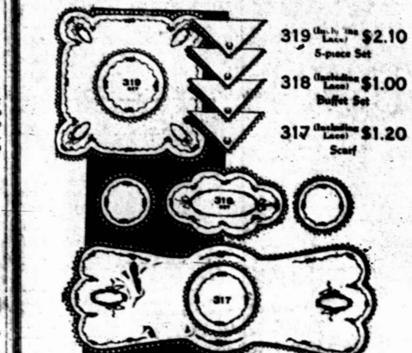
White Cover Blank

With Royal Society Guaranteed Boiling Dye Embroidery