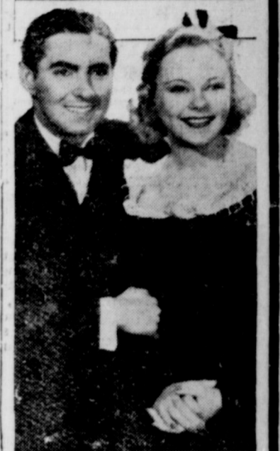
Tyrone Power and Sonja Henie, feature stars in the Irving Berlin's "Second Fiddle" at the Lyric Friday and Saturday.

film. Other tune hits are: "I'm Sorry for Myself," "An Old Fashioned Tune Always Is New," "Song of the Metronome," "When Winter Comes" and "I Poured My Heart Into a Song," all by Irving Berlin. Based on a story by George Bradshaw, "Second Fiddle" was directed by Sidney Lanfield, with Gene Markey as associate producer.