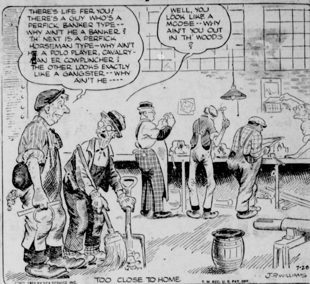
TOO CLOSE TO HOME