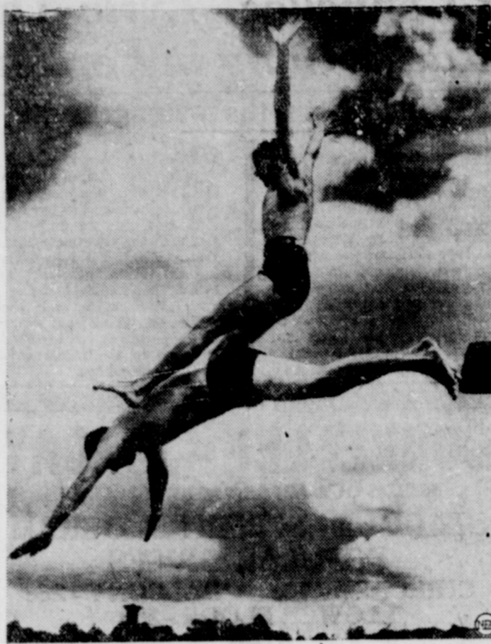
Here's a picture with plenty of splash . . . at least pair executing double dive against a background of clouds at pool in Cropton, Surrey, England, will have plenty of splash in a second.