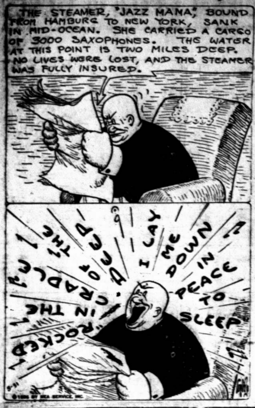
The Papers Say