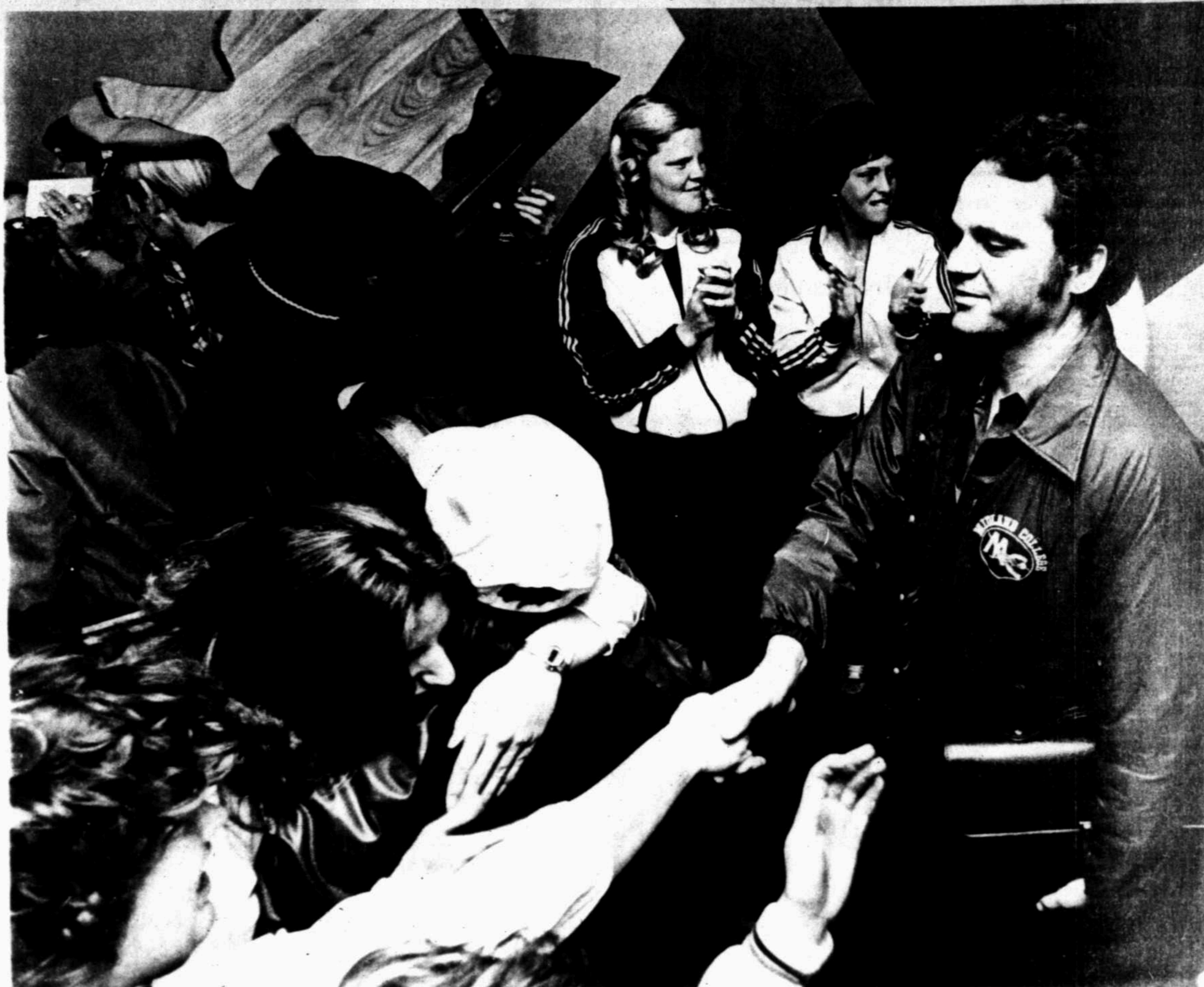
Welcoming home the champs

Twenty-two Michigan State college students came on an old school bus, renovated with bunks and stereo and painted bright yellow and orange.