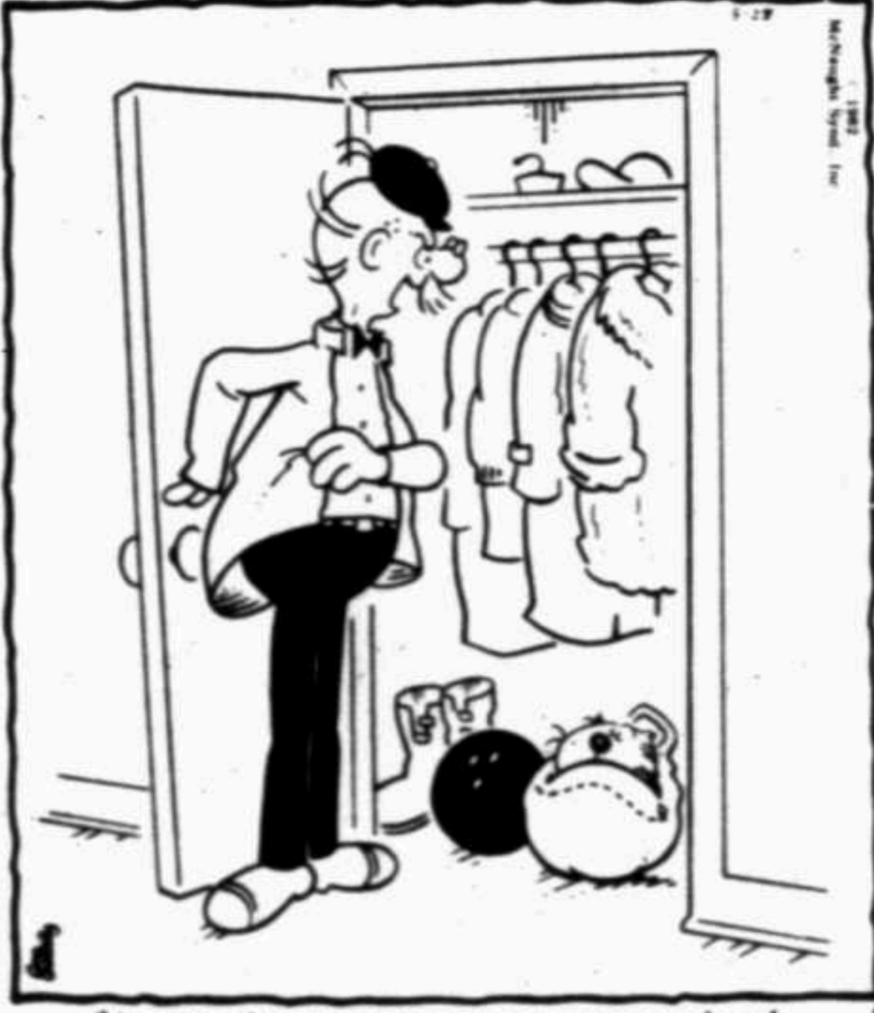
"YES, IT'S MY BOWLING NIGHT, AND NO, I DON'T WANT COMPANY!"