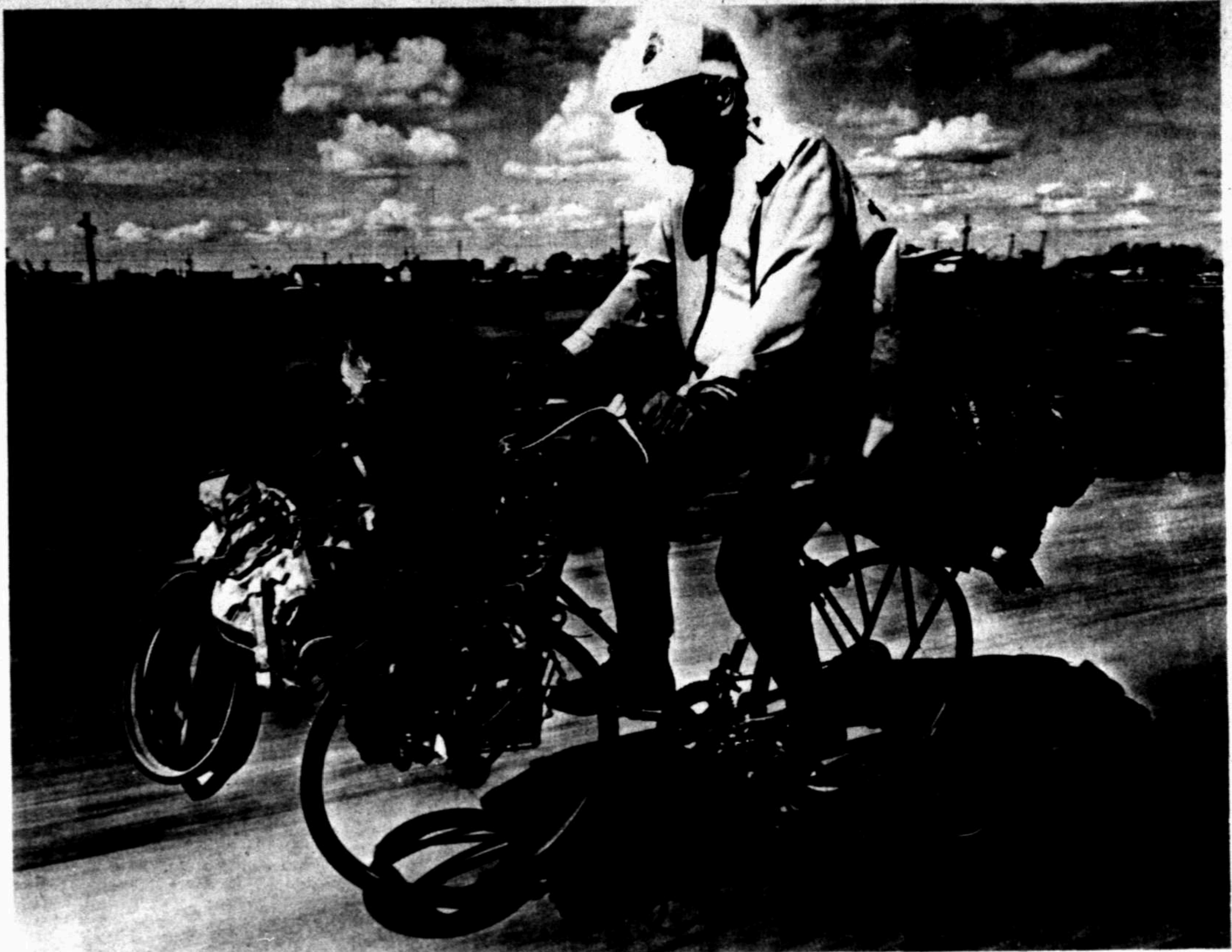
A-biking he will go

In other action, the council deferred action on a proposal for a bowling center and lounge at Holiday Hill Road and Loop 250, approved requests for a specific use permit at a restaurant in Mesa Verde shopping center and a zone change for Green Tree North, and signed proclamations for Substance Abuse Awareness Week and Year of the Bible.