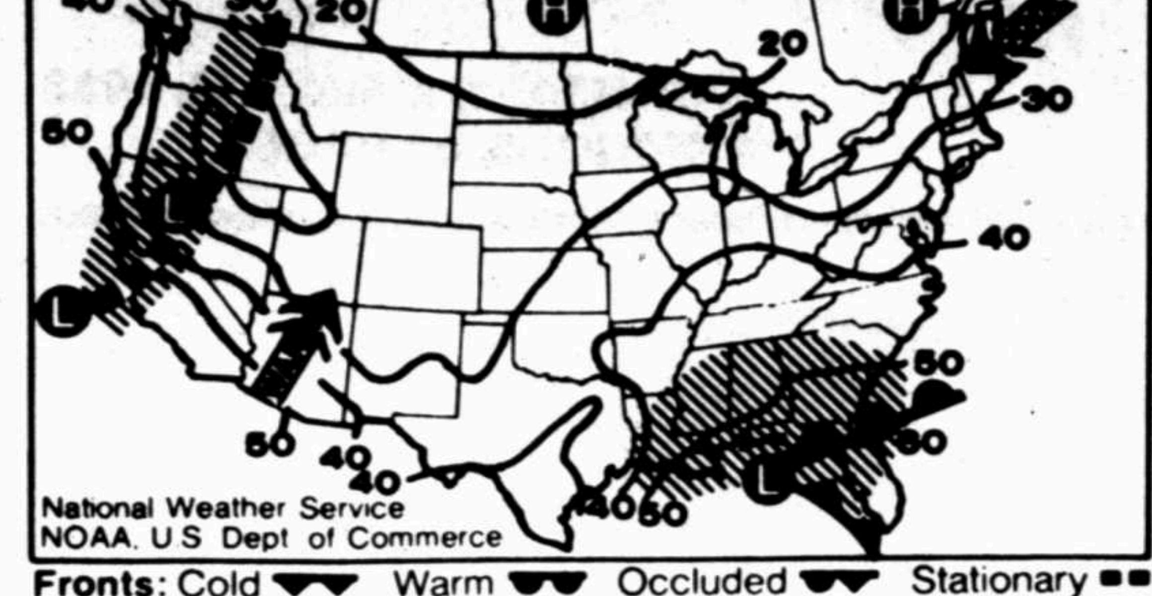
National Weather Service NOAA, U.S. Dept. of Commerce

The Forecast For 7 a.m. EST Thursday, March 17 Low Temperatures