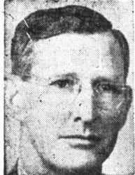
By DICK O'BRIEN