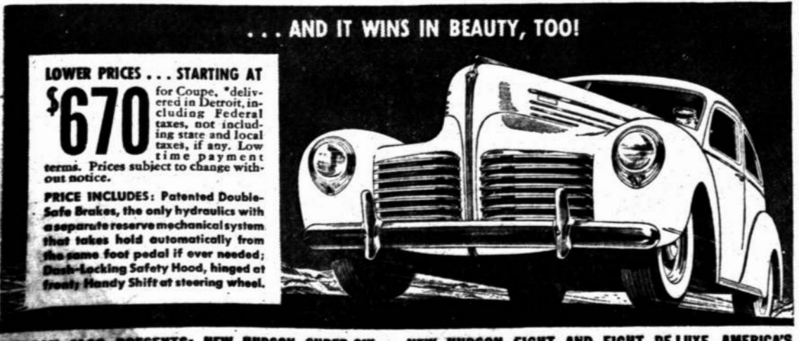
Car shown is new Hudson Six Sedan, $795*, delivered in Detroit

LOWER PRICES... STARTING AT $670 for Coupe, *delivered in Detroit, including Federal taxes, not including state and local taxes, if any. Low time payment terms. Prices subject to change without notice. PRICE INCLUDES: Patented Double-Safe Brakes, the only hydraulics with a separate reserve mechanical system that takes hold automatically from the same foot pedal if ever needed; Dual-Locking Safety Hood, hinged at front; Handy Shift of steering wheel.