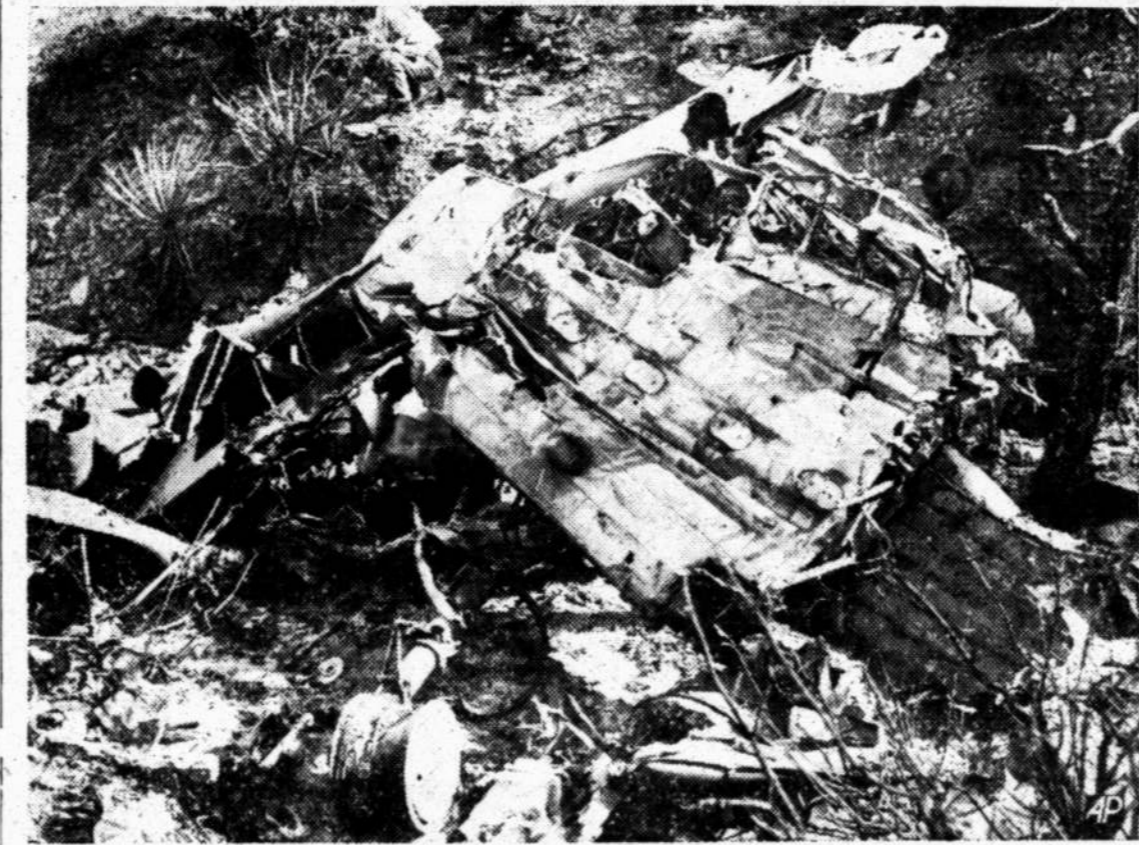
After a 5-day search, the charred ruins of an Army observation plane from Biggs Field, near El Paso, were found strewn about a canyon in the San Andres Mountains of Southern New Mexico. The three occupants were burned beyond recognition.