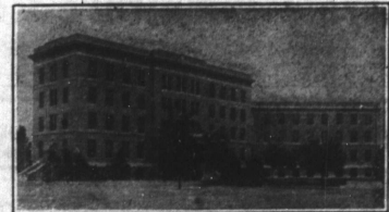
The Healing Hands of West Texas Baptists