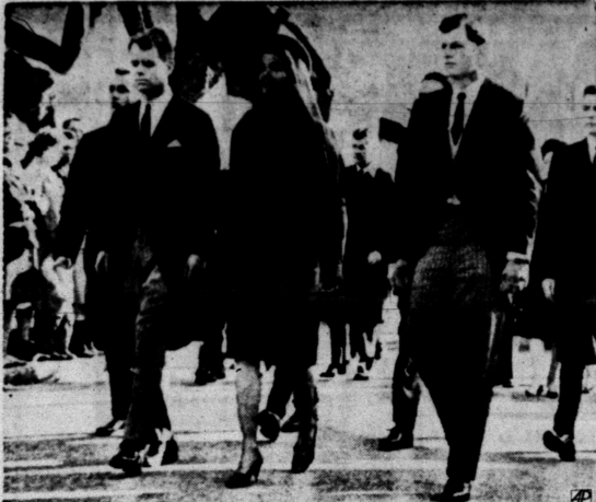
HEADS FUNERAL PROCESSION TO CHURCH — Mrs. Jacqueline Kennedy and two brothers-in-law head the procession as the body of the slain president is borne from the White House to St. Matthews Roman Catholic Church. At left is Attorney General Robert Kennedy and on right is Sen. Edward M. Kennedy of Massachusetts.