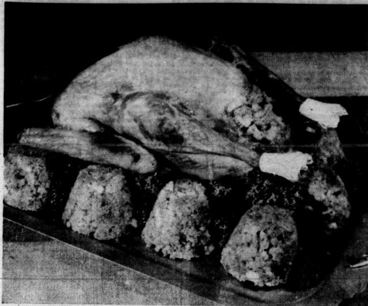
GALA HOLIDAY STUFFINGS for the family who likes more than one kind of dressing. Individual cups of stuffing surrounding the turkey are an added fillup to your dinner.