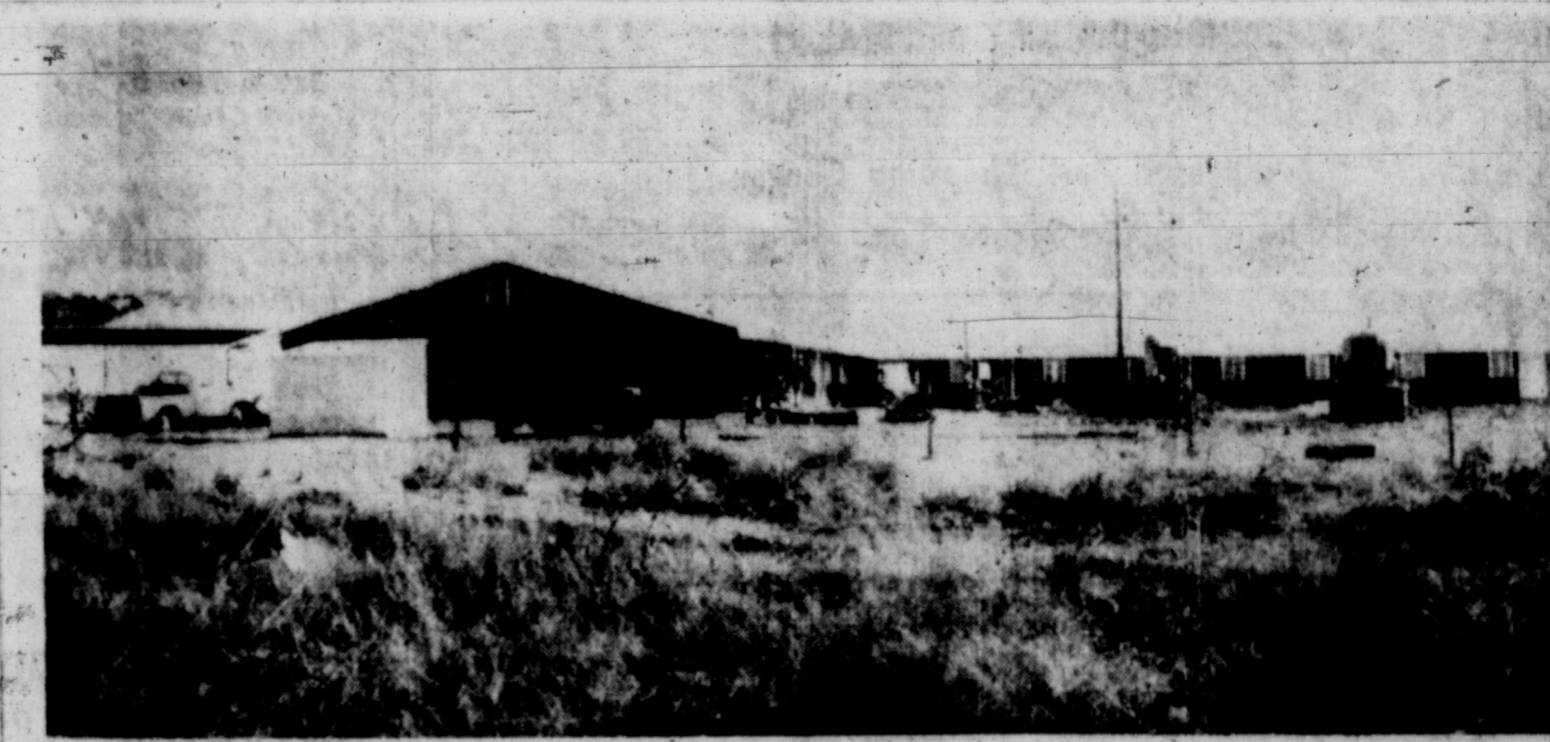
Bricking Begins Monday

Thursday night's meeting of the local Cancer Unit is to be in progress to report that "somebody was throwing