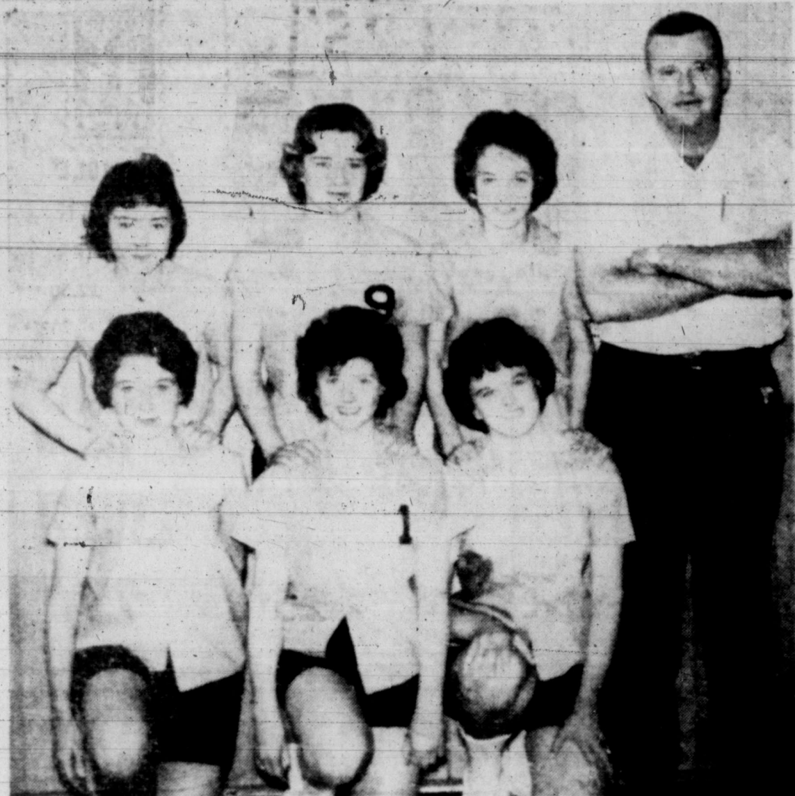
Loraine Junior High Champs