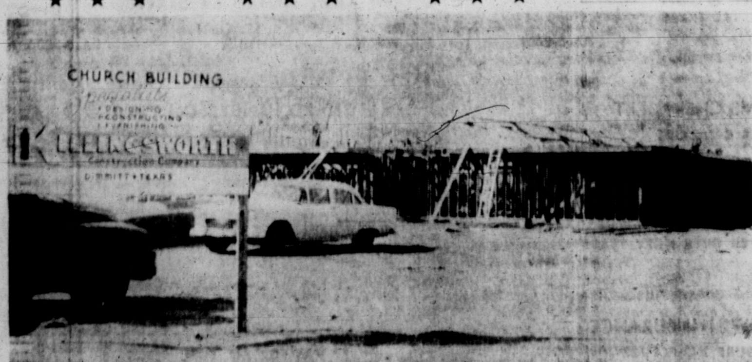
Church of Christ Building