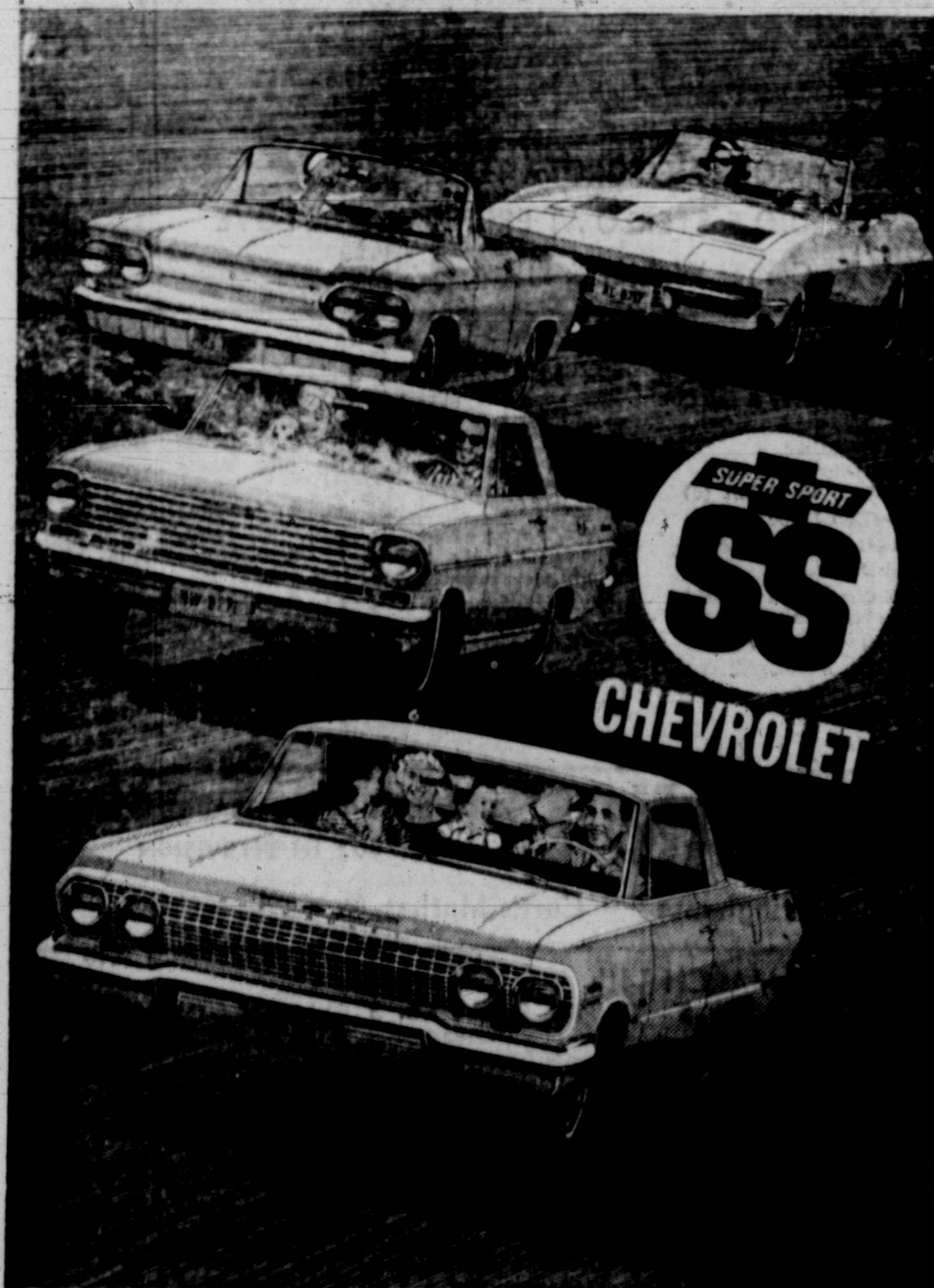
Pictured from top to bottom: Corvette Sting Ray Convertible, Corvair Monza Spyder Convertible, Chevy II Nova SS Coupe, Chevrolet Impala SS Coupe. (Super Sport and Spyder equipment optional at extra cost.)

seats. It even offers a new Comfortilt steering wheel* that positions right where you want it. . . . The new Chevy II Nova SS has its own brand of excitement. Likewise the turbo-supercharged rear-engine Corvair Monza Spyder and the all-new Corvette Sting Rays. Just decide how sporty you want to get, then pick your equipment and power—up to 425 hp in the Chevrolet SS, including the popular Turbo-Fire 409* with 340 hp for smooth, responsive handling in city traffic. *optional at extra cost