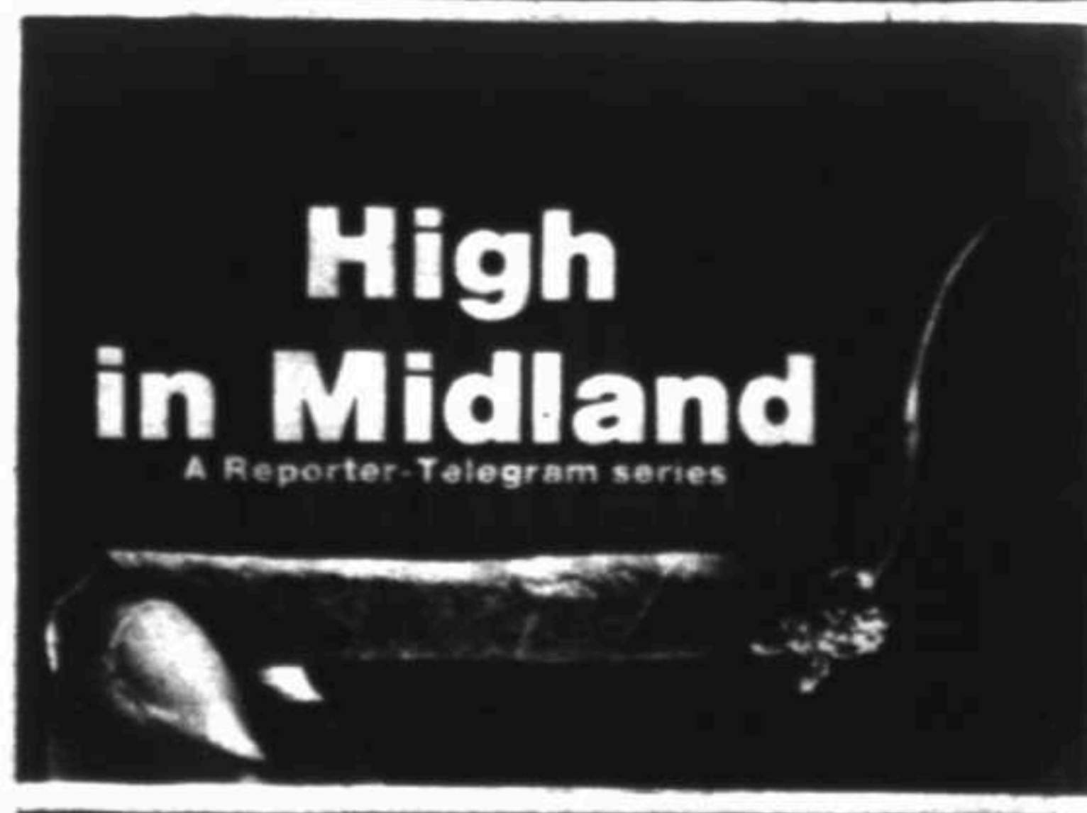
High in Midland A Reporter-Telegram series

He bounds in on sneakers, dressed in a bright Polo sport shirt and jeans. He brushes his short, light brown hair off of his tanned face, looks at you with big, brown eyes through tortoise-shell glasses and smiles, flashing orthodontic-straightened white teeth. The wrist of his left arm is encircled by a Rolex watch; his fourth finger by a gold band. He radiates the charm and confidence of a 33-year-old with a couple of small, well-mannered children, a beautiful wife, a re-decorated downtown office, lovely northside home and a $30,000 sports car. He's a member of the third generation Midland club, an independent oilman — one of the Learjet crowd. "Dope fiends can charm your ass off," he admitted with a boyish grin. Growing up in Midland with a fifth of V.O. under one seat and a fifth of Bacardi under the