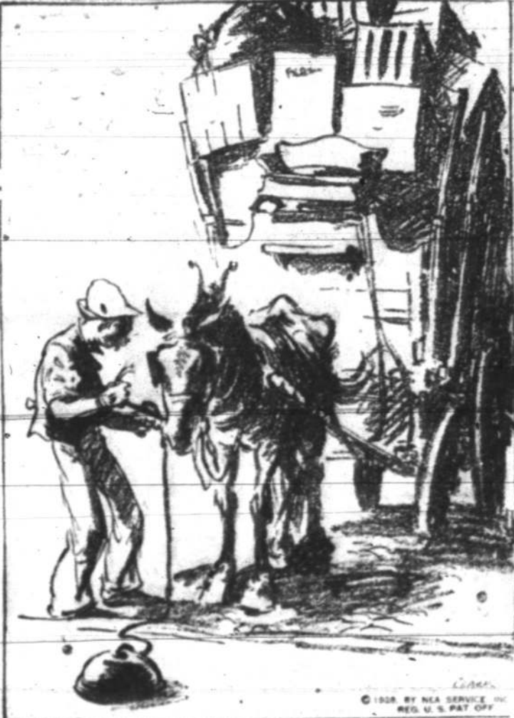
The height of precaution.