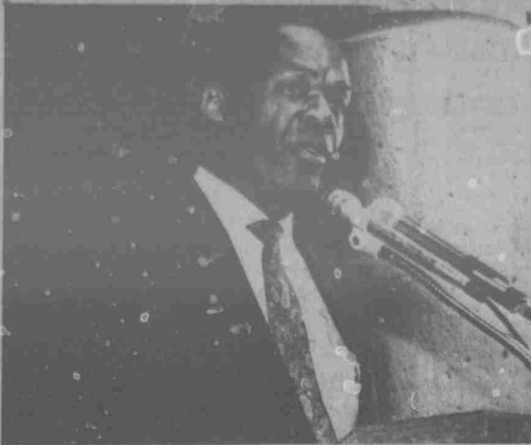
Mayor Barry addresses press conference at Frank Reeves Municipal Center on Tuesday.

Mayor Marion Barry says he's seen the much-publicized videotapes of events which led to his arrest at the Vista International Hotel, and he doesn't feel they contain anything that could warrant his conviction on cocaine possession charges.