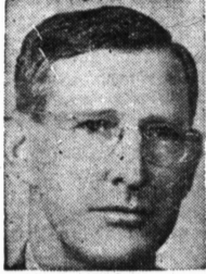
By DICK O'BRIEN