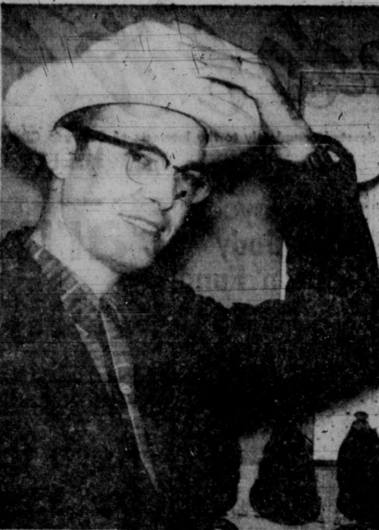
Joins Straw Parade