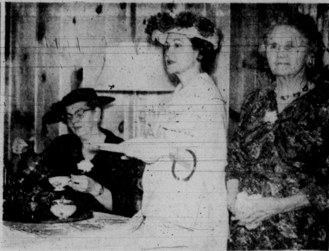
At Tea Table

Colorado - Scurry National Farm Loan Association 135 W. 2nd Colorado City