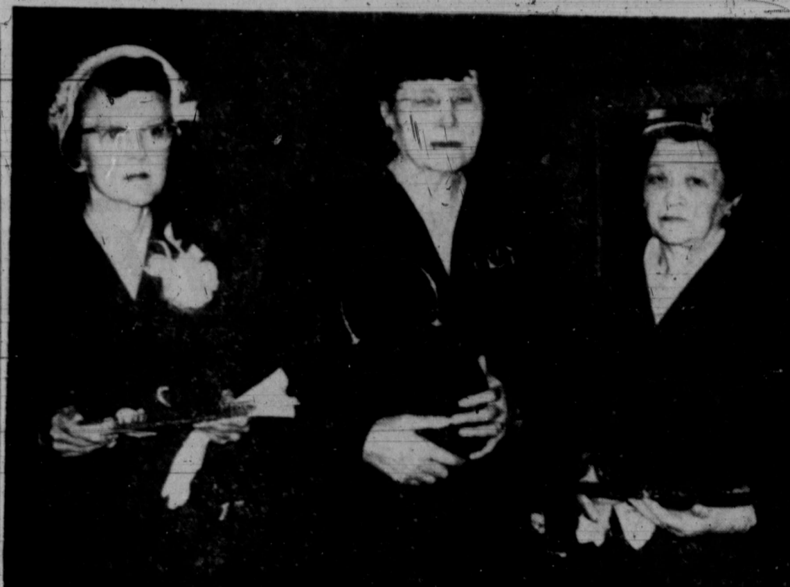
Attend Federation Tea