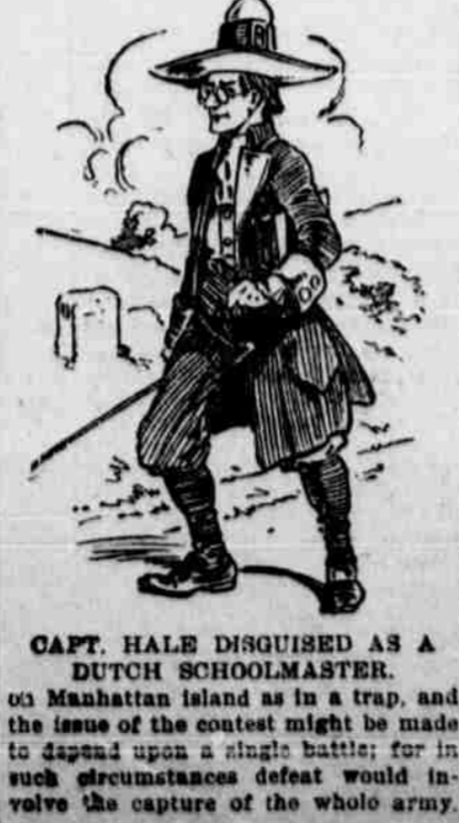
CAPT. HALE DISGUISED AS A DUTCH SCHOOLMASTER.

Captain Nathan Hale. A Martyr of the Revolution. General Washington wanted a man. It was in September, 1775, at the city of New York, a few days after the battle of Long Island. The swift and deep East River flowed between the two hostile armies, and General Washington had as yet no system established for getting information of the enemy's movements and intentions. He never needed such information so much as at that crisis.