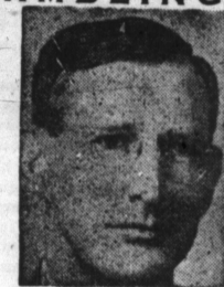
By DICK O'BRIEN