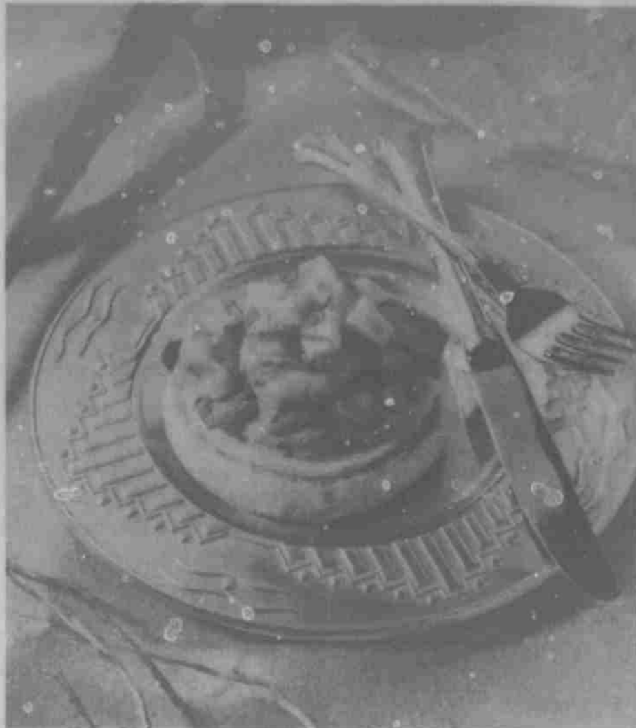
This unusual dish with a Southwestern sizzle, "Bays Grilled Shrimp with Papaya Salsa," won first place in the 1990 Bays English Muffin Recipe Contest. Featuring an exotic array of flavors and colors, the winning recipe tops two toasted English muffin halves with grilled red and yellow pepper slices and marinated, grilled shrimp. An unusual salsa of papaya, onion and jalapeno peppers complements this entree, whose creator received a one-week trip for two to the renowned LaVarenne Cooking School in Burgundy, France.