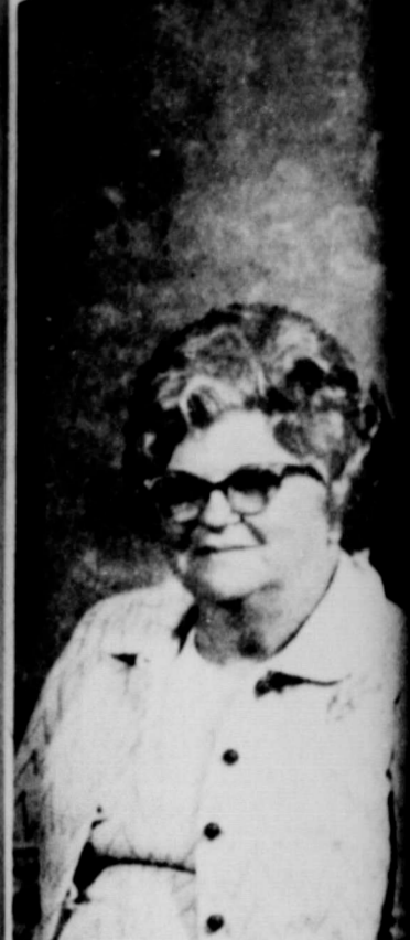
MR. AND MRS.