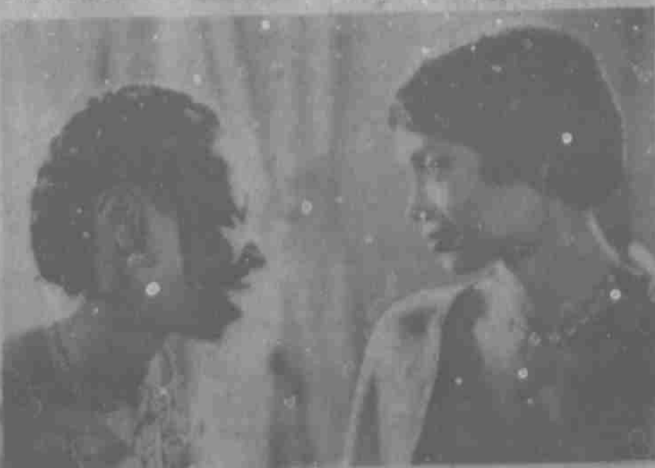
Whoopi Goldberg (left) stars as Celie, Margaret Avery as blues singer Shug Avery, who recognizes Celie's beauty and loves her -- despite Celie's marriage and Shug's long-time affair with the same man. 'The Color Purple'

Directed by Steven Spielberg, THE COLOR PURPLE was nominated for 11 Academy Awards,