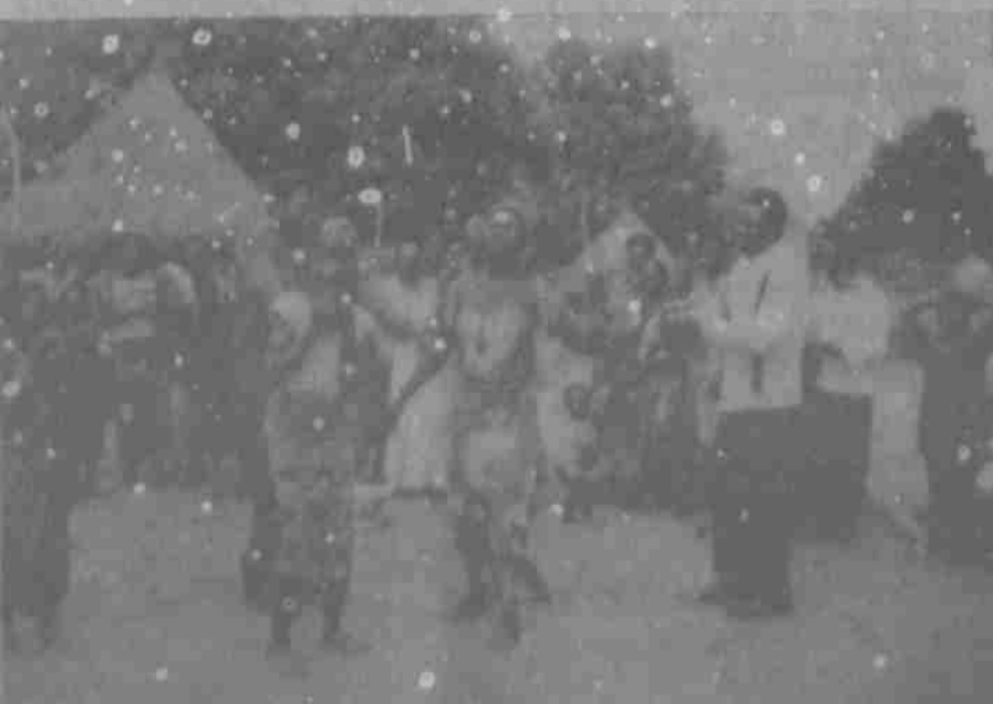
INFECTIOUS JOY, CONTAGIOUS KNOWLEDGE -- Chadian villagers sing and dance to call their neighbors to join in a community health meeting, sponsored by CARE, the international relief and development organization. CARE's health workers use traditional Chadian music, dance and stories to stress the importance of clean water and nutritious food to impoverished villagers in Chad's northern farming communities.

This special program is sponsored by the Lubbock City-County Library.