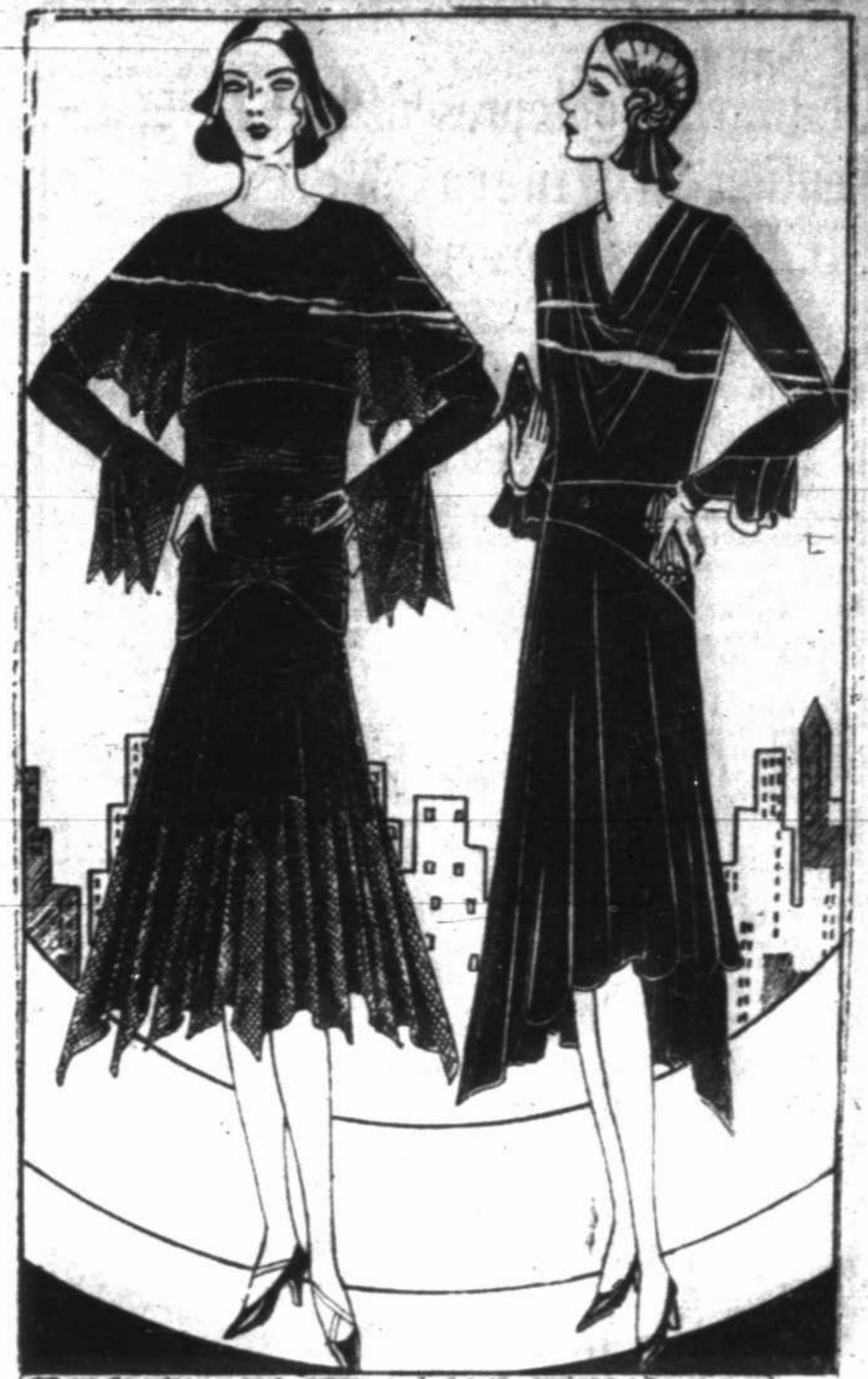
ILLUSTRATING TWO ACTUAL STYLES IN THE ELYNOR GROUP