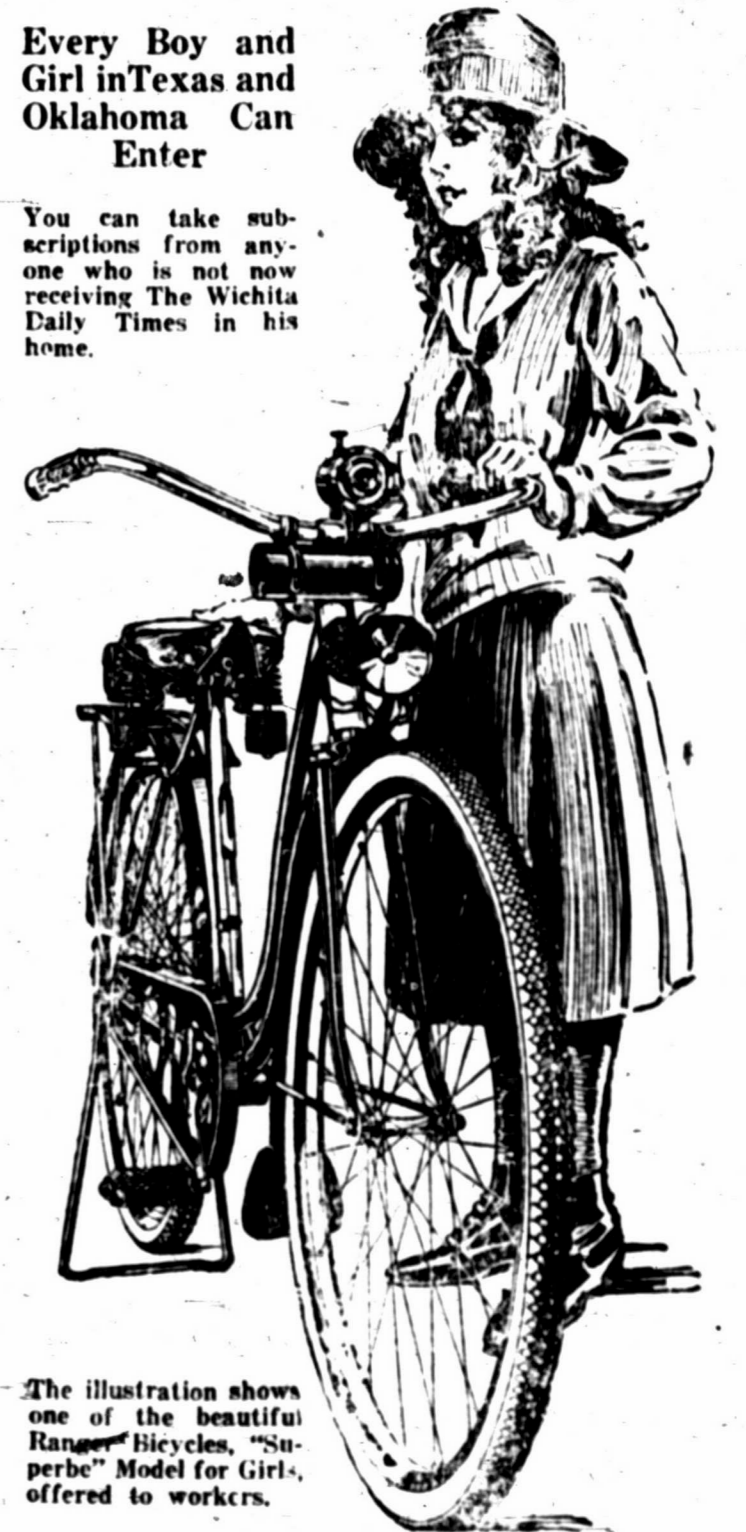
The illustration shows one of the beautiful "Ranger" Bicycles, "Superbe" Model for Girls, offered to workers.

You can take subscriptions from anyone who is not now receiving The Wichita Daily Times in his home.