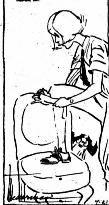
The young lady across the way says it sounds pretty awful to say that 25 per cent of all the money raised by the government in the war expenses but we ought not to make up our minds definitely without knowing what percentage goes into other things.