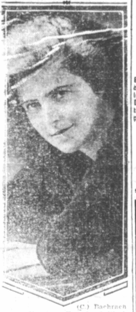
Mrs. Harrison Tweed, of Washington, D. C., shown above in a striking study, was recently a visitor at Newport, R. I., fashionable summer resort. Known to the literary world as Michael Strange, Mrs. Tweed formerly was the wife of John Barrymore, film star.