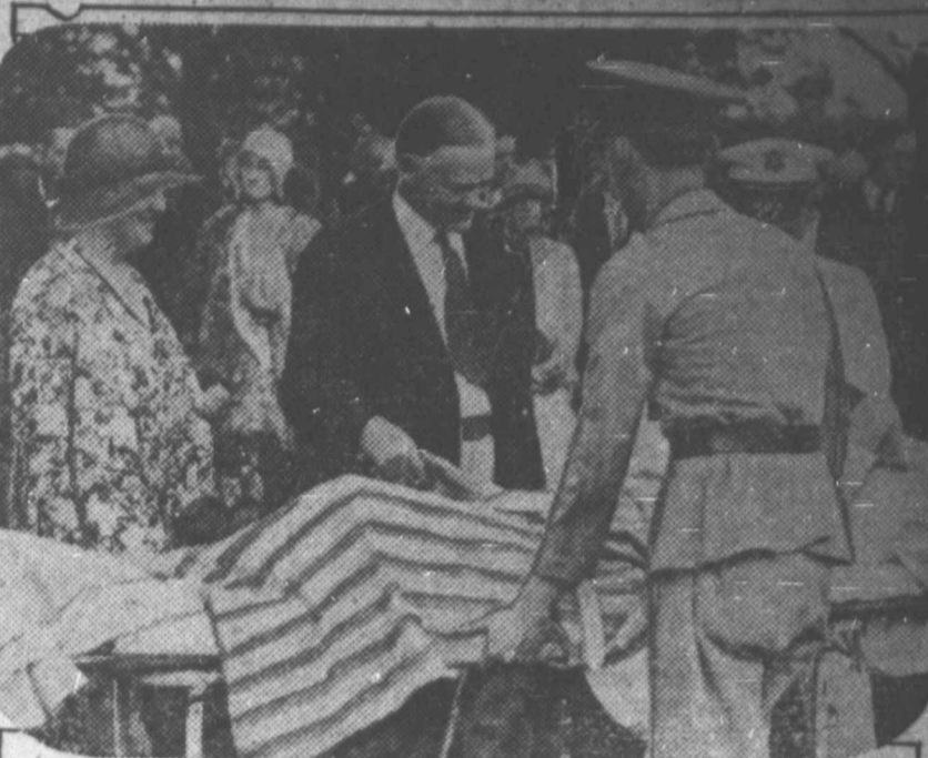
Mrs. Hoover made her first public appearance since her recent illness to join the president in receiving more than 500 wounded World War veterans at a garden party held recently on the White House lawn in Washington. The president and the First Lady are shown above greeting a bed-ridden guest.