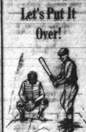
Let's Put It Over!

Insurance FIDELITY AND SURETY BONDS HEMPHILL WOODS CO. (Lubbock Insurance Agency) Citizen Nat'l Bank Bldg Phone 267