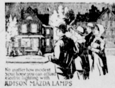
No matter how modest your home you can afford electric lighting with ADISON MAZDA LAMPS

Make your Home Attractive by its Lights It Won't Cost much and helps the looks of any home.