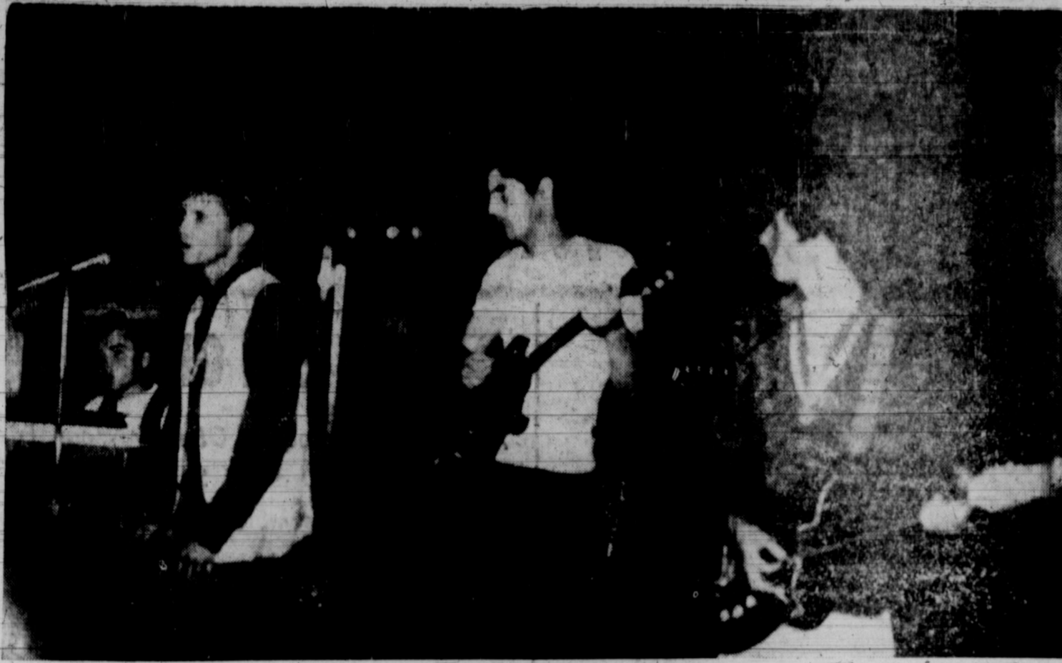
"Battle of the Bands" Winners

The Crystal Ship of Sweetwater was chosen best of four bands playing in the second annual "Battle of the Bands" here last Friday evening in Wolf Gymnasium. The group, who received a $100