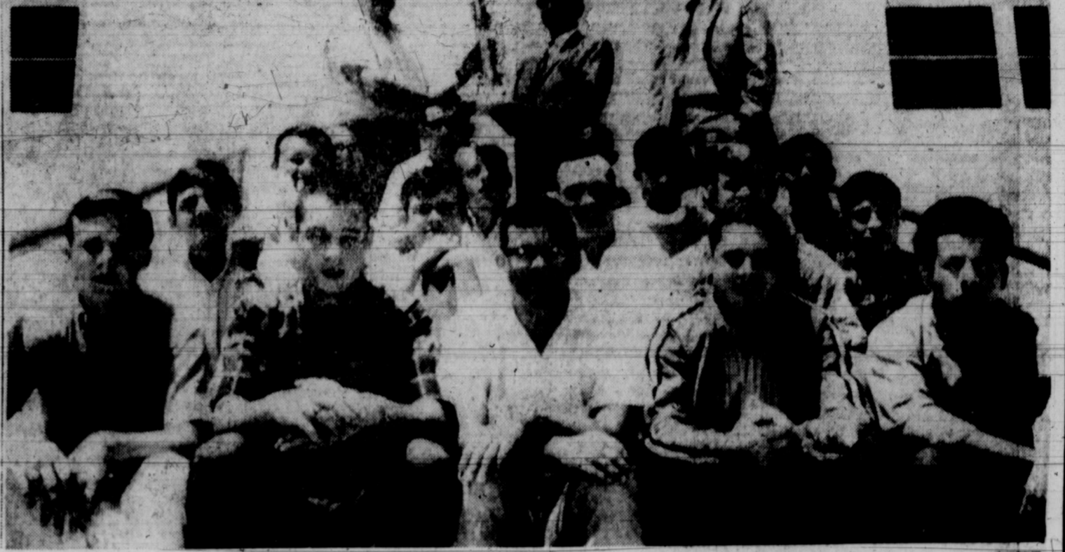
CHS Wolves Get Trophy