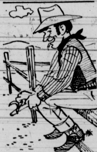
THEM WHUT'S GOT, GITS, BUT IT'S THAT FIRST GITTIN' THAT'S HARD.