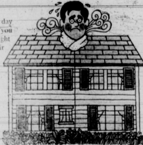
Lone Star Gas

A breakdown on a typical summer day could accomplish just that! That's why you ought to consider gas air conditioning right now! It's built to be relied on. Gas air conditioning is built simply, ruggedly, with no compressor, fewer moving parts. That means less things to go wrong... and added years of dependable service and comfort. Call Lone Star Gas for a free estimate on reliable gas air conditioning.