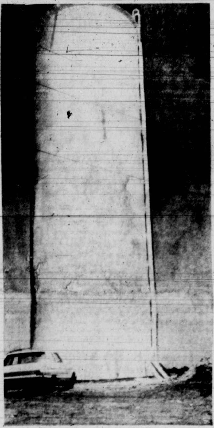
New Storage Tank For Lake Water System

Already in place near Lake Colorado City is this silver water tower for storing treated water to be bought from the city by Mitchell County Utilities Corp. The privately owned corporation, founded by Glen Hemphill, will service lake cottages and camps with water and with natural gas.