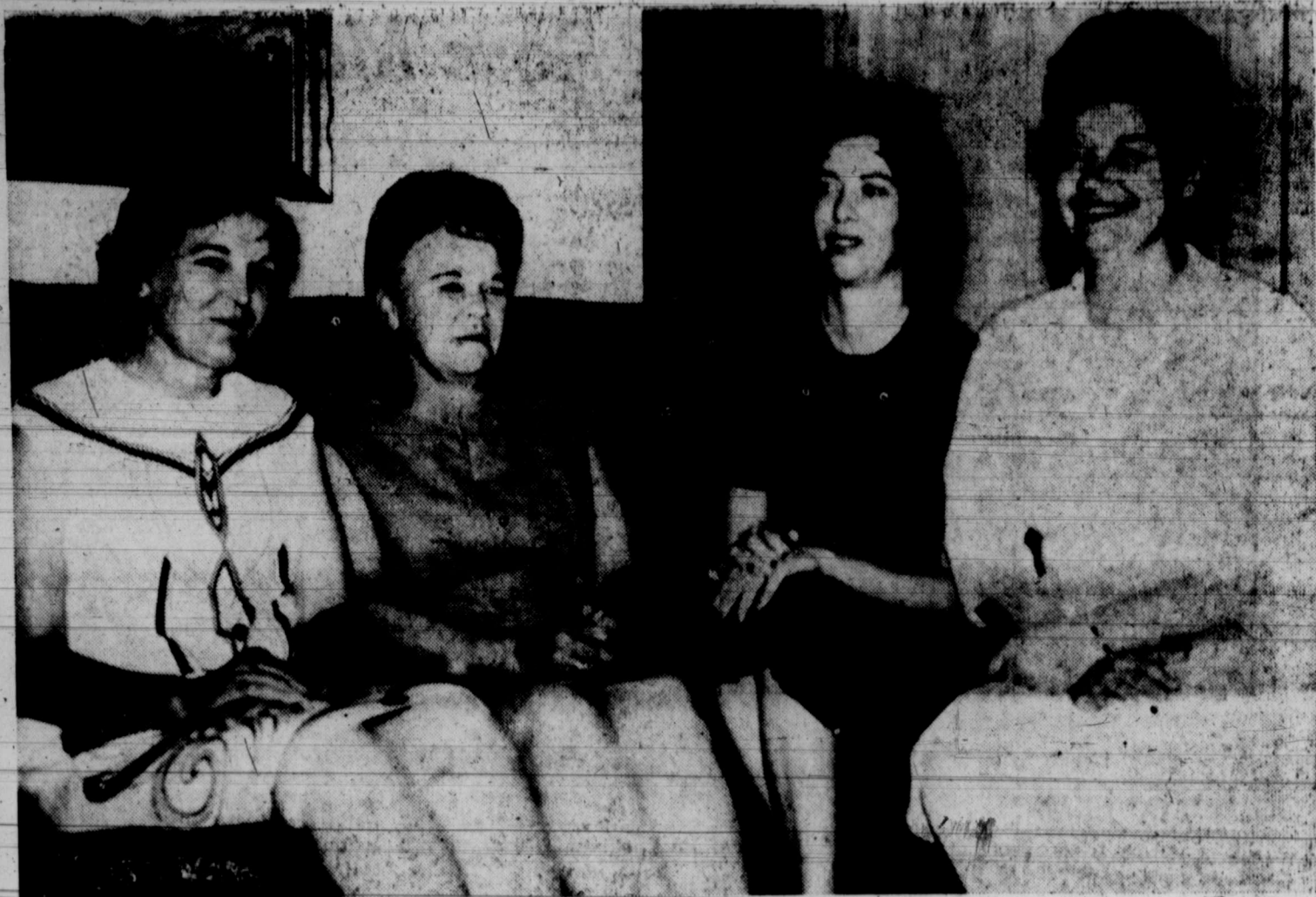
Installed for VFW Auxiliary