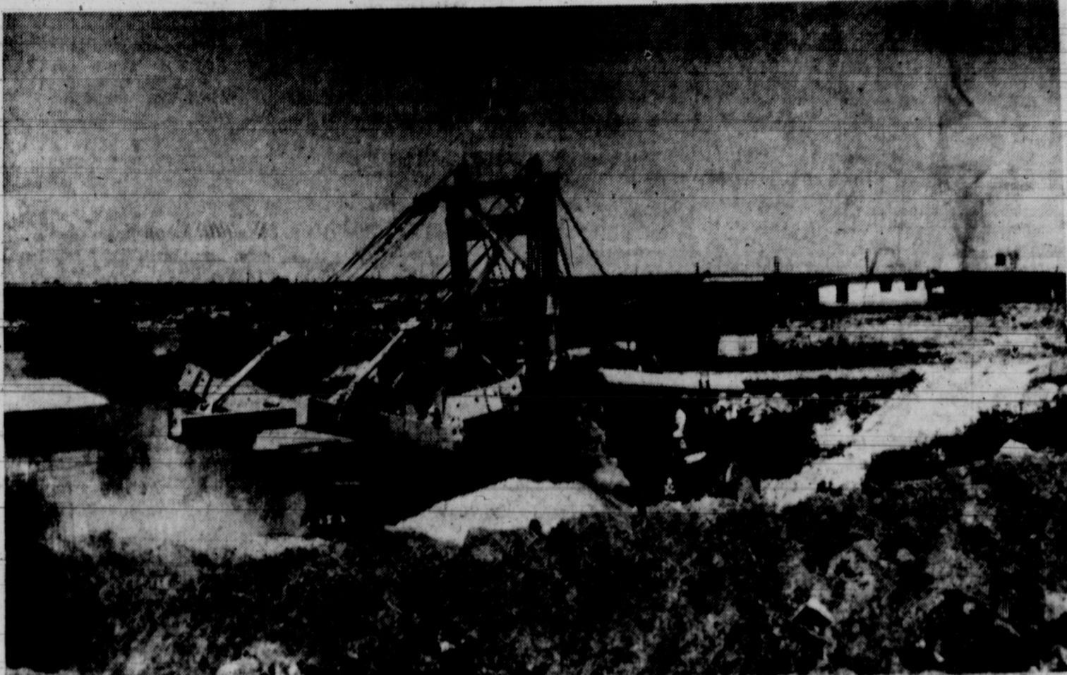
Ditch Digging Equipment At Work Near Cooper's Cove

With pipelines on the near side of Lake Colorado City almost ready to be tested, crew was busy Tuesday in the Cooper's Cove area. Six-inch pipelines for water from Colorado City will be paral-