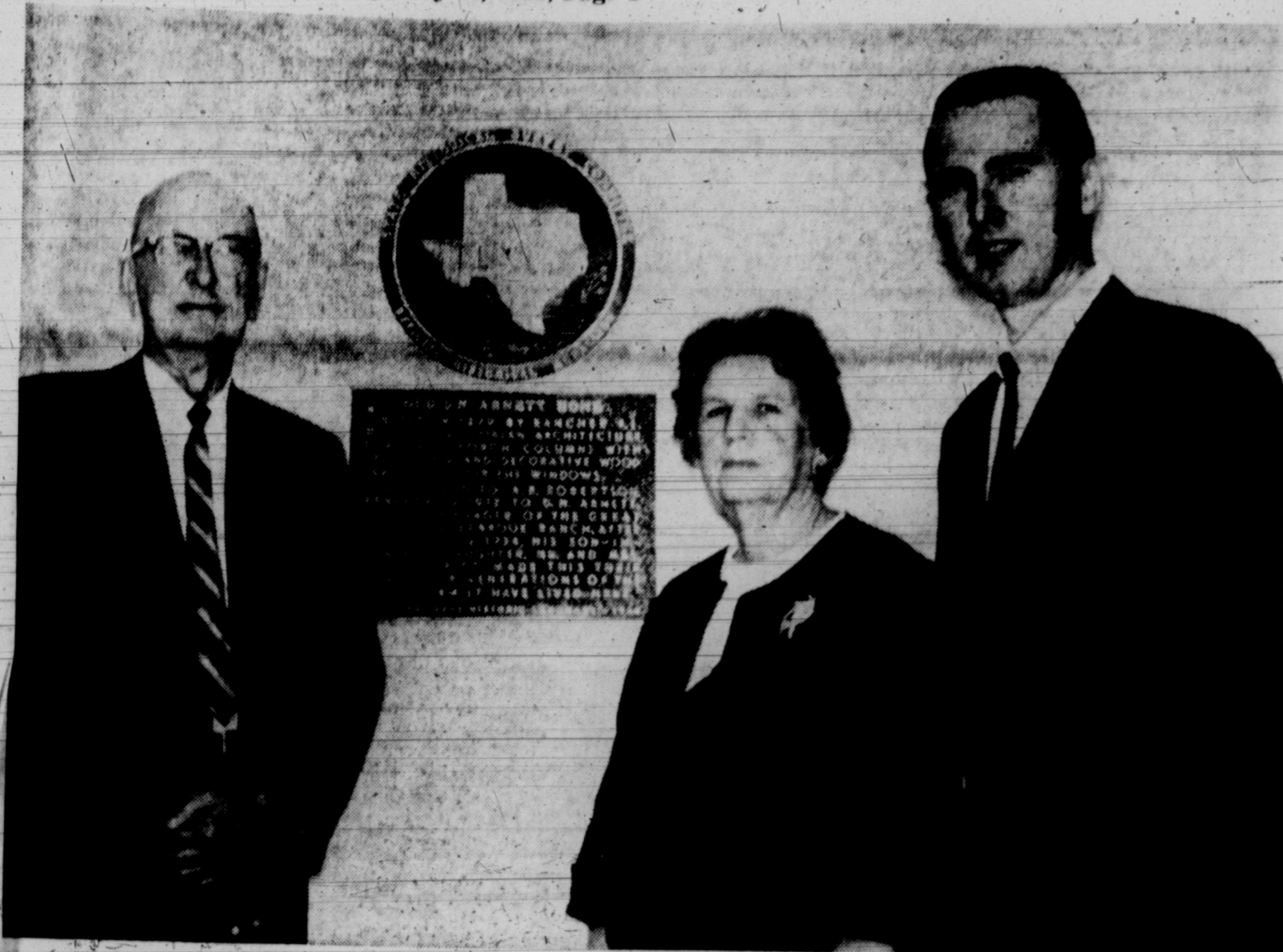
Marker For Historical Home Dedicated