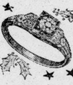
Diamonds Ideal Gift—Perfect Cut