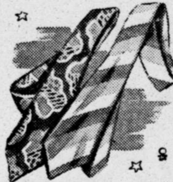
TIES $1.50 Assorted Patterns