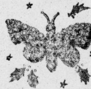
Jewelry Gold and Sterling