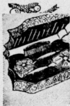
Dresser Set $6.95 up