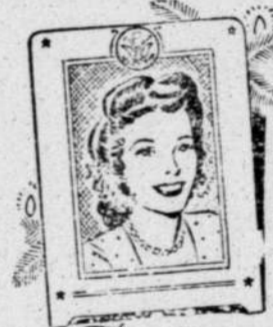
The Way to a Soldier's Heart Frames $1.00 up