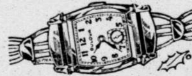
17 Jewel Watches $49.50