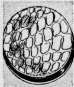
Compacts $1.00 up