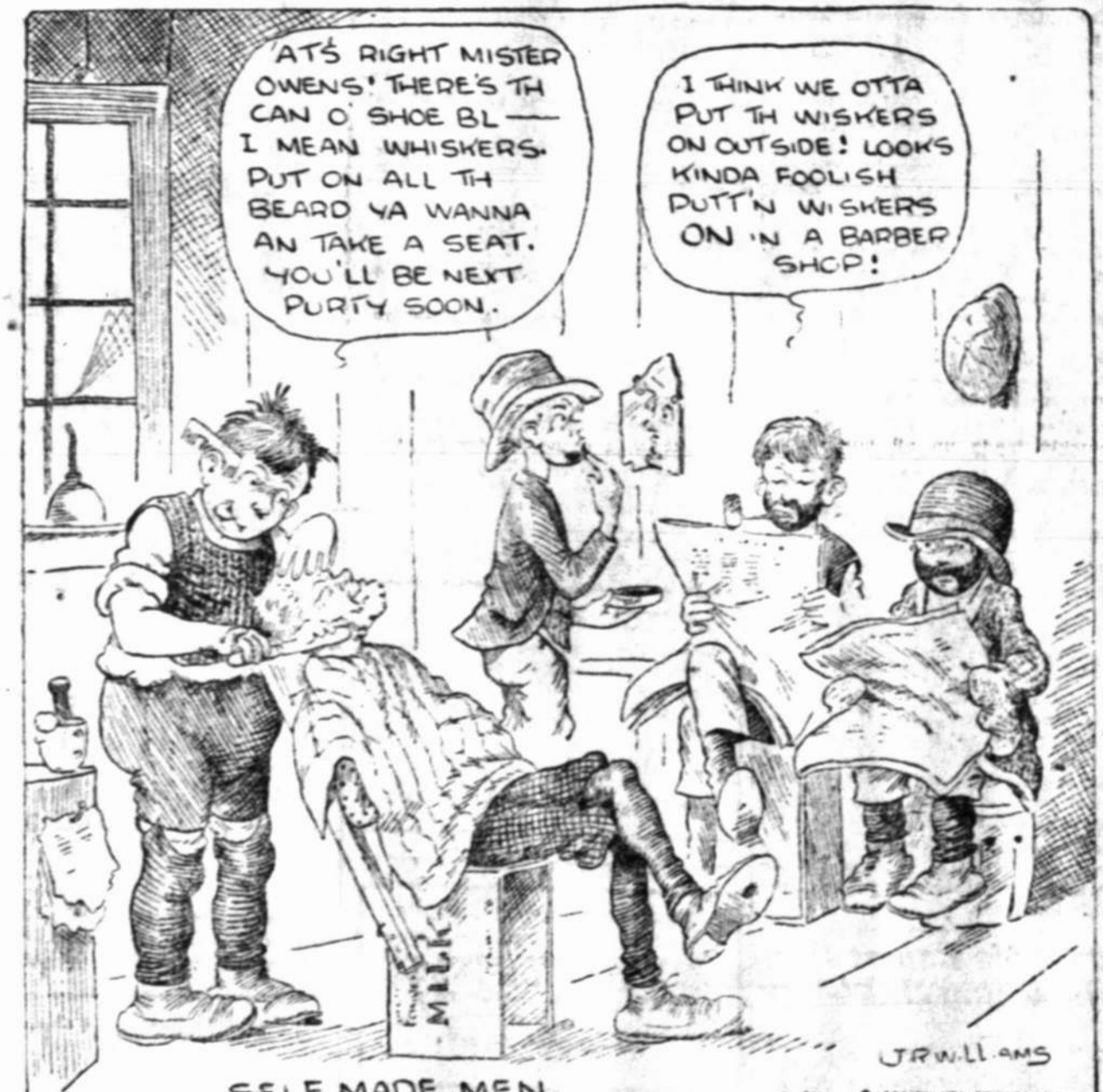
SELF MADE MEN.