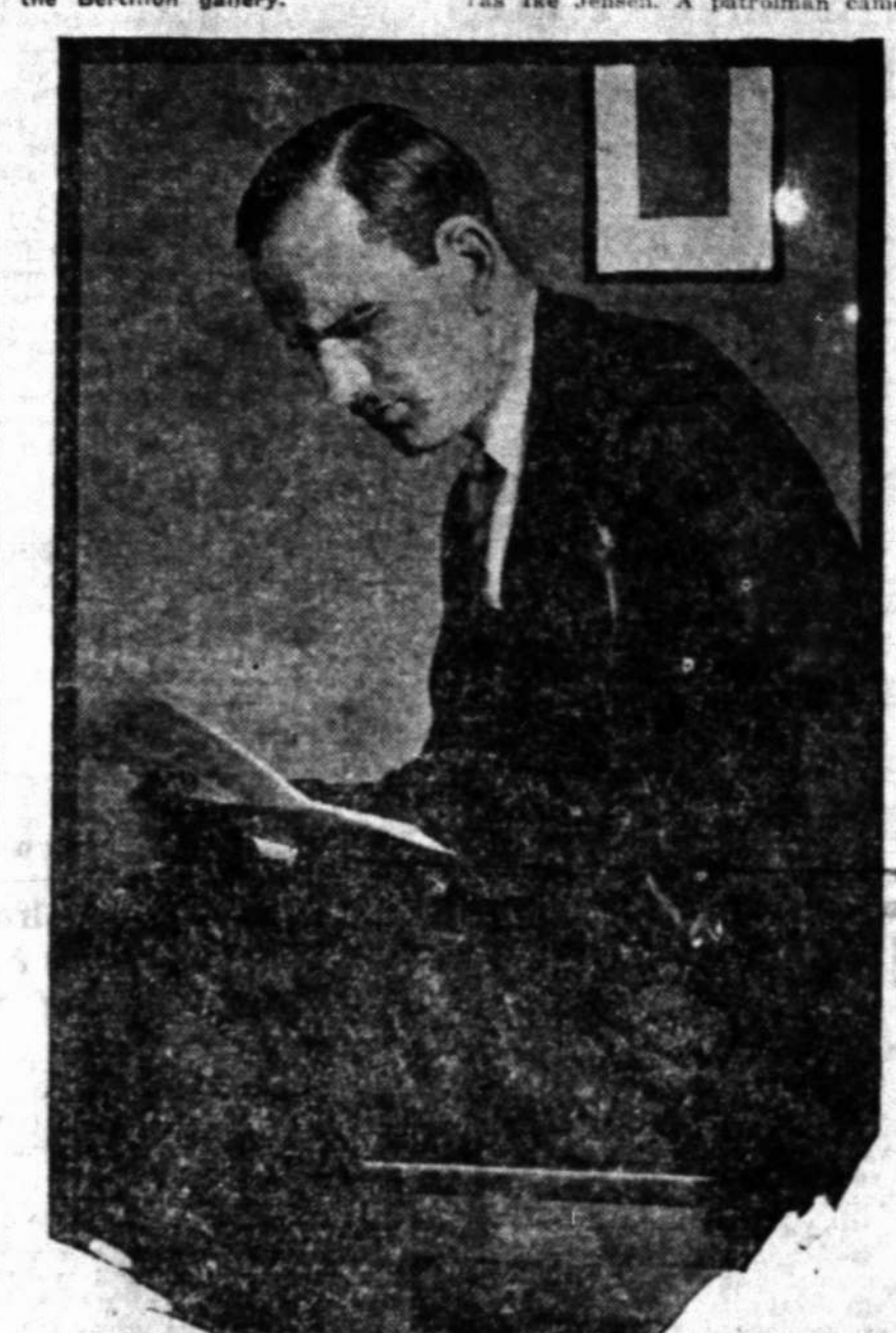
It was another unsigned note of warning, telling him to leave town.