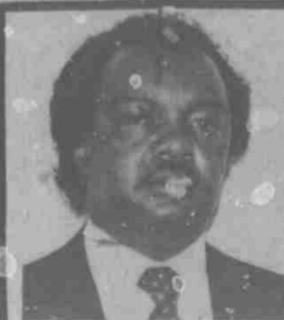
FROM THE OF PARSON D. A. SMITH

"Worry" is defined as an emotional attitude characterized by anxiety about the outcome of future events. Benjamin Disraeli says of worry, it is "a god, invisible but omnipotent. It steals the bloom from the cheek and lightness from the pulse; it takes away the appetite, and turns the hair gray."