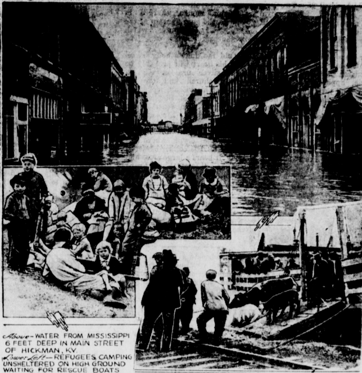
Water from Mississippi six feet deep in main street of Hickman, Ky. Refugees camping on high ground waiting for rescue boats. First boatload of refugees and stock being unloaded at Hickman from ferry boat owned by Stevey.

(By Associated Press) HICKMAN, Ky., April 25.—Fleeing the waters of the Mississippi River and its tributaries, which were carrying a record volume of flood water, and pounding at every levee and embankment, inhabitants of the low lying lands near here trudged through miles of mud and marshy lowland to seek shelter and food.