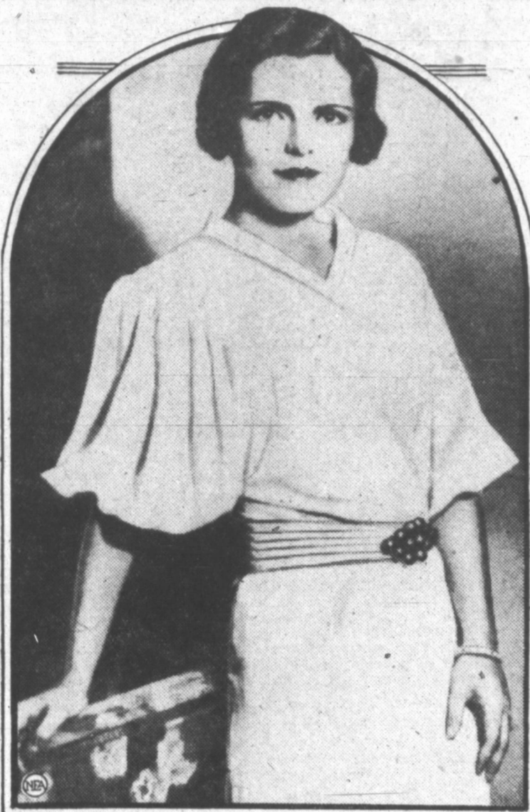
HERE is a recent portrait of Mrs. Elliott Roosevelt, who was Miss Ruth Googins of Fort Worth before her marriage to the president's son Saturday night at the home of her uncle in Burlington, Iowa. Mr. and Mrs. Roosevelt are now on a trip through the west.