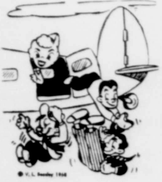
It Happens Every Time We Fly Over

The ONLY things kids wear out QUICKER than SHOES, is their PARENTS and TEACHERS.