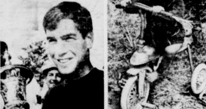
NEW WHEELS , from an anonymous benefactor in Sacramento, Calif., for tiny Vietnamese who lost her first tricycle in the war.