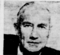
Honorable Strom Thurmond United States Senator from South Carolina Chairman, Thurmond Speaks Committee