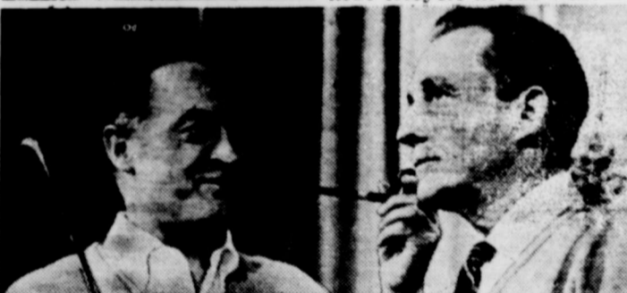
OLD PROS Bing Crosby (right) and Bob Hope exchange quips at rehearsal for their Oct. 23 appearance on Crosby's RCA TV special on NBC. They'll be joined by The Supremes.