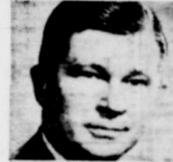
Honorable John G. Tower United States Senator from Texas Chairman, Nixon Key Issues Committee