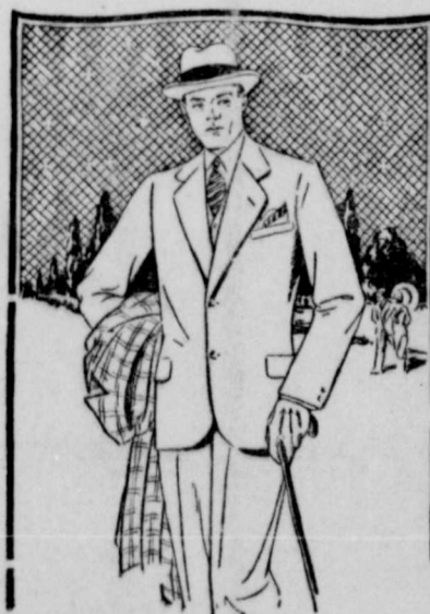
SUITS, SUITS, SUITS!

Table No. 1, Choice 98c Table No. 2, Choice $1.48 Table No. 3, Choice $1.98