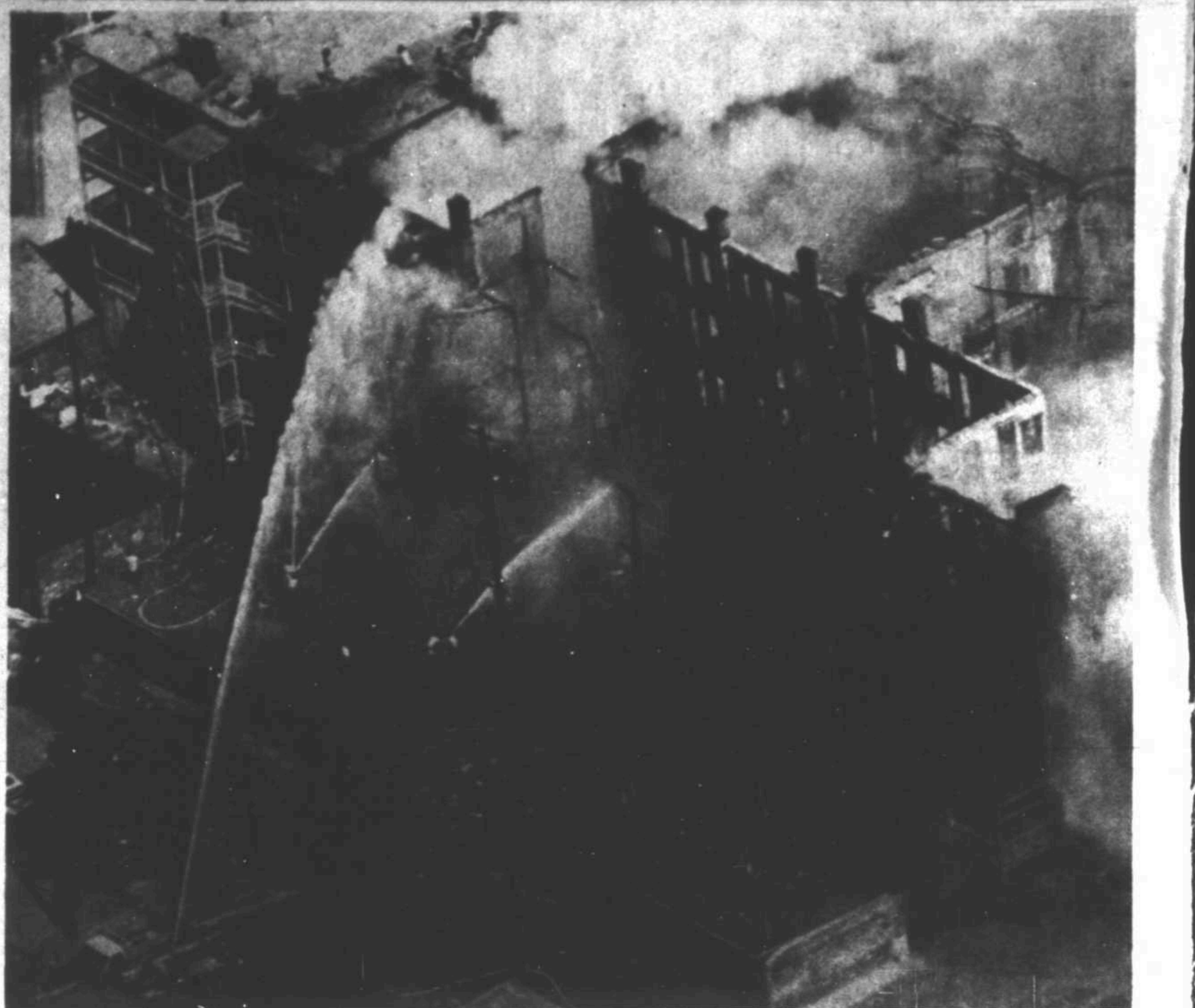
Four apartment blocks were destroyed by fire in the "Flats" section of Holyoke, Mass., Sunday, leaving over 200 people homeless. This marked the fifth major fire in the city in the past two months.

There was no official damage estimate, but the buildings were destroyed. Four apartment blocks were destroyed by fire in the "Flats" section of Holyoke, Mass., Sunday, leaving over 200 people homeless.