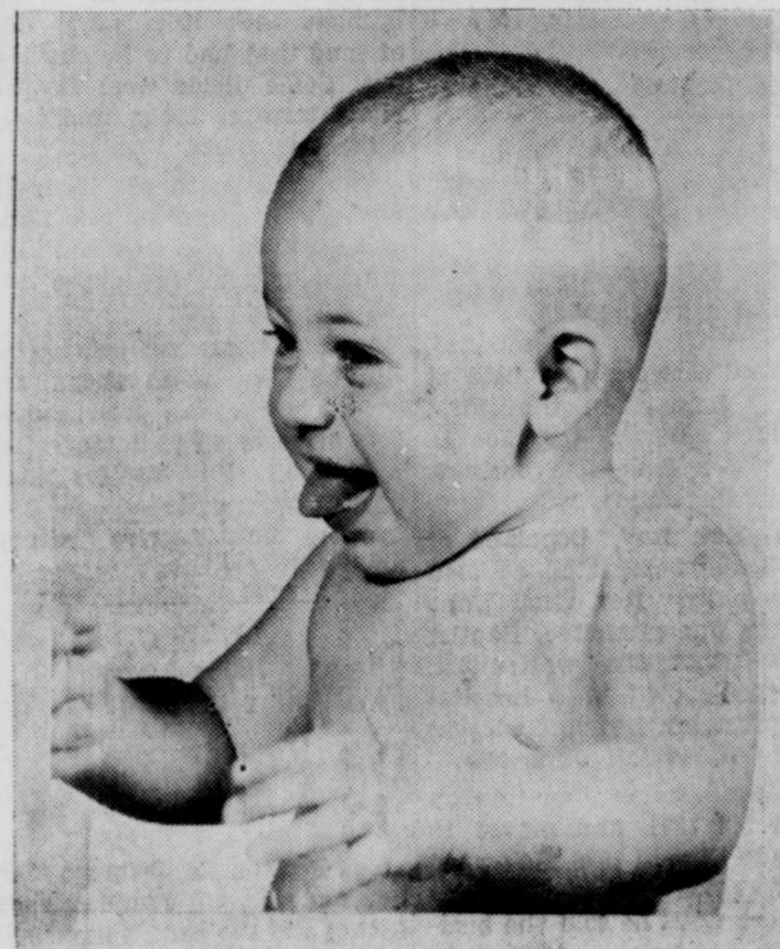
"The only disadvantage to banking by mail . . . is licking the stamps."

Except for that, our bank-by-mail service takes all the work out of depositing. Second easiest deposit method; Just drive up to our Auto-Bank windows. We've brought banking to the HIGHEST level of service yet . . . in all our departments. See us for any financial need . . . checking accounts, savings, home loans, car loans, farm loans (crop or livestock). And don't forget one of our safe-deposit boxes is the place to keep all your important papers.