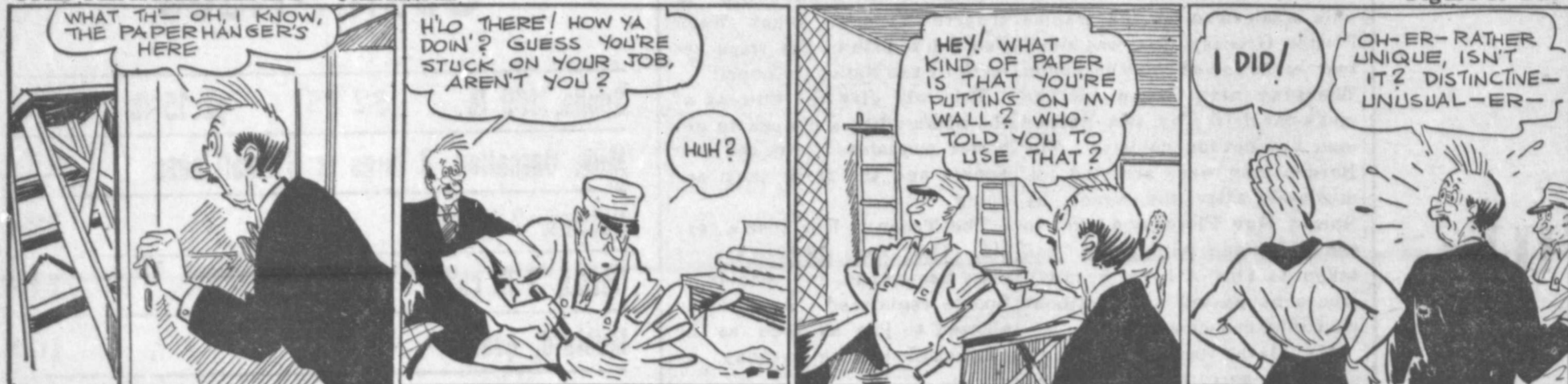
Figure It Out