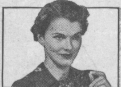
People Everywhere Are Adopting This Remarkable "Phillips" Way

The way to gain almost incredibly quick relief, from stomach condition arising from overacidity, is to alkalinize the stomach quickly with Phillips' Milk of Magnesia.