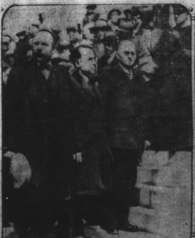
Sacco (right) and Vanzetti when Judge Thayer pronounced their sentences. Their last photo.