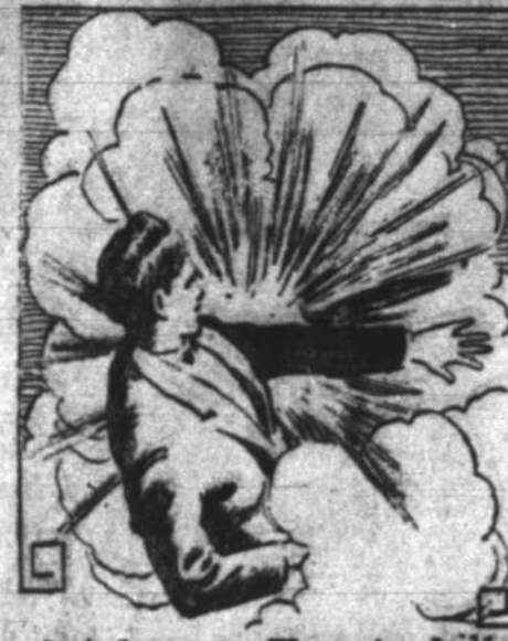
October 21 - Twenty killed by bomb in Communist demonstration of protest in Paris