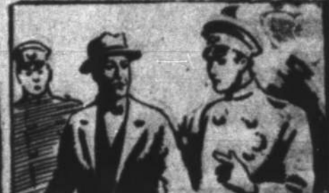
May 5, Sacco and Vanzetti arrested