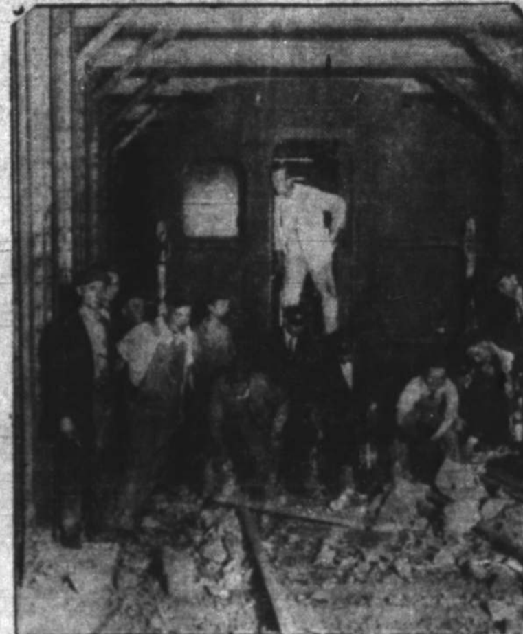
UNDERGROUND DEATH IN NEW YORK - Trainmen and trainees examining the damage done by one of the bombs set off in two New York subway stations, killing one and injuring a score of persons. Sacco-Vanzetti sympathizers were suspected by the police, although among the suspects questioned was a disgruntled ex-employee of the underground.