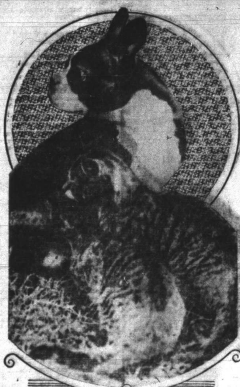
A cat and dog life left so bad after all, according to these two orphaned kittens...