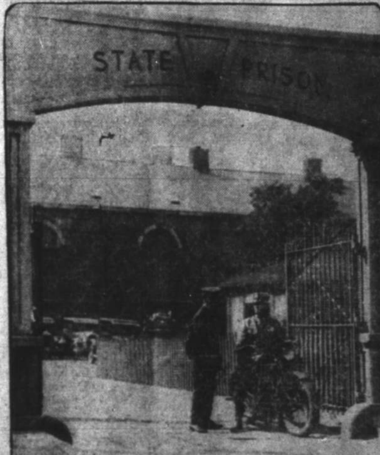
The portal of the state prison at Charlestown, where Sacco and Vanzetti will die.