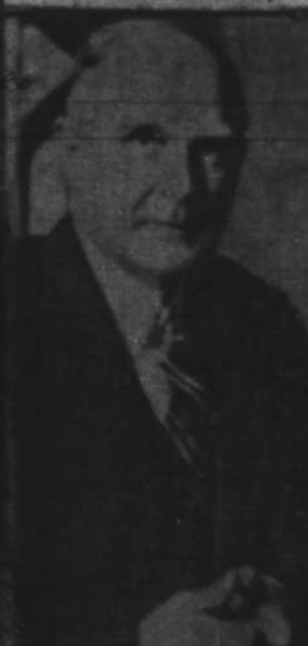
VIRNON ALVAN F. FULLER, Massachusetts, who refused Sacco-Vanzetti's clemency to the two radicals.