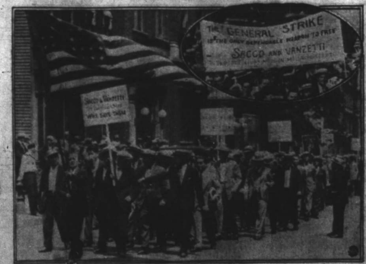
The voice of millions, raised vainly in behalf of Nicola Sacco and Bartolomeo Vanzetti, is symbolized here. The photographs are of parades and mass meetings staged by New York, immediately after Gov. Fuller of Massachusetts announced the two men must die. In Brooklyn, two thousand barbers left their work to march through the streets, carrying banners protesting against the executions. Inset is a banner posted at a great mass meeting in Union Square, New York City, urging a general strike and a boycott of Massachusetts-made goods. Similar scenes are being staged around the world.