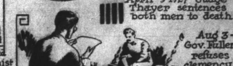
Aug 3 - Gov. Fuller refuses clemency