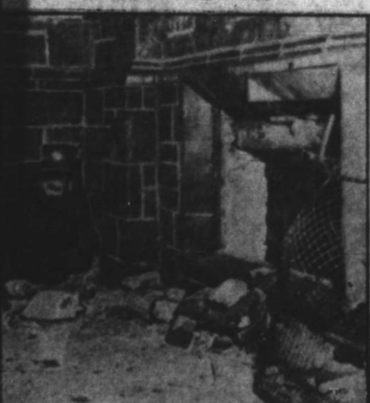
Bomb believed to have been tossed through a window of Emmanuel Hymnbook store, Philadelphia, wrecked the basement, broke all windows and threw the neighborhood into a turmoil of excitement. This photo shows how a section of the lower wall was ripped out by the blast.