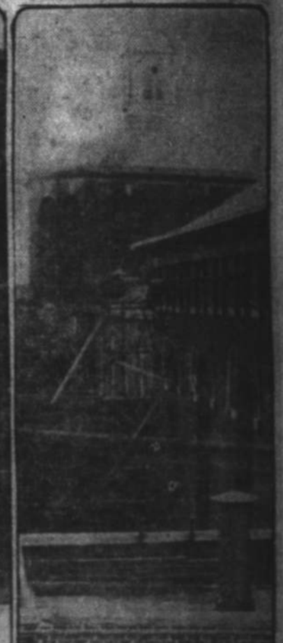
Another view of the Charlestown prison.