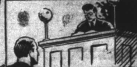
July 14, 1921 - Both convicted of first degree murder