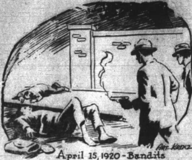
April 15, 1920 - Bandits murder paymaster and guard