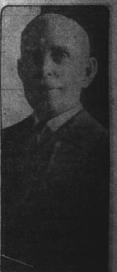
Judge Webster Thayer, who conducted the trial.