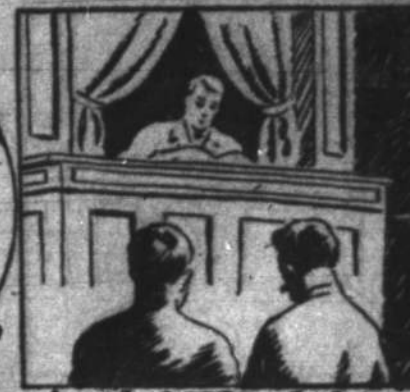
April 9 1927 Judge Thayer sentences both men to death