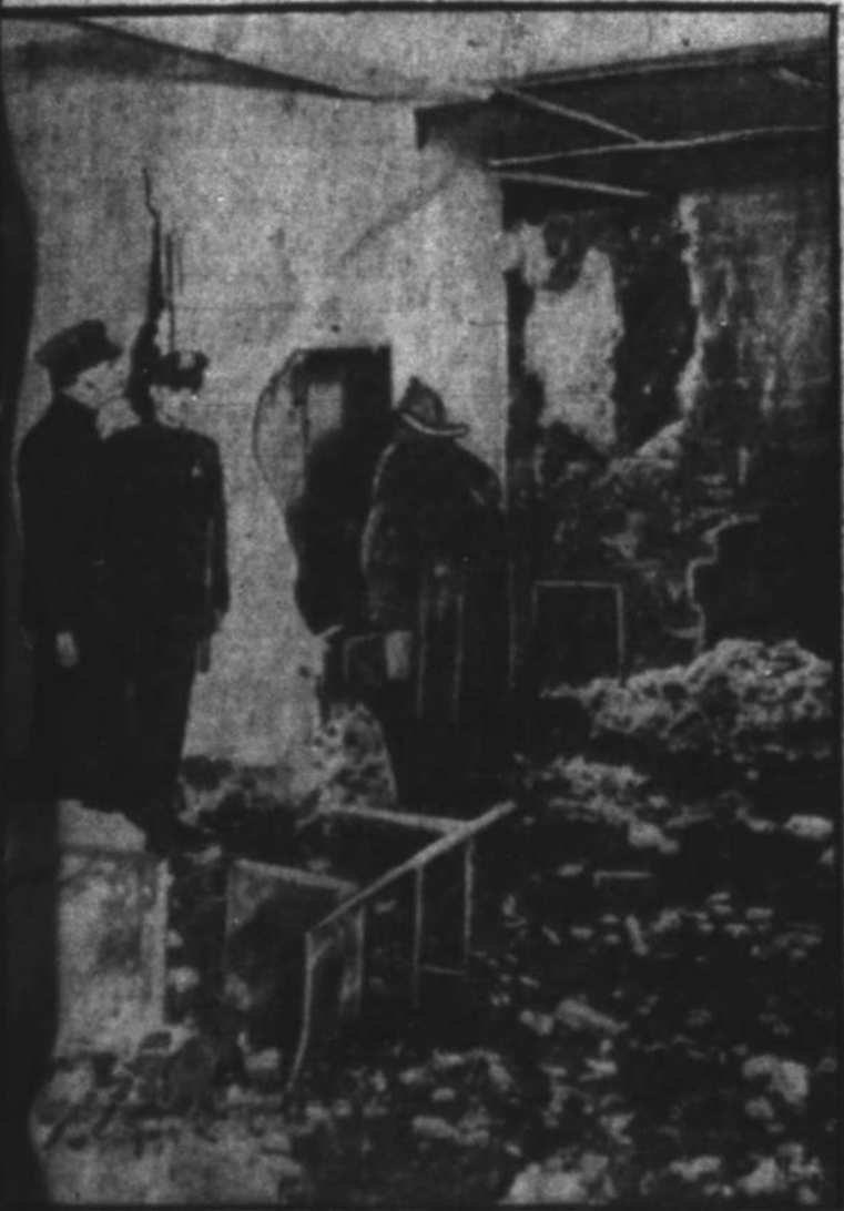
... was killed and a number were injured when a mysterious wrecked the Broadway-23rd street subway station in New York. This shows the wreckage after the blast with police and firemen exploring the details.