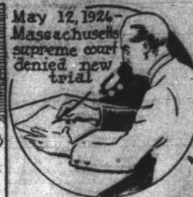
May 12, 1924 - Massachusetts supreme court denied new trial