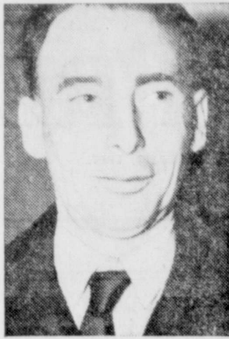
AUGUST E. DE SCHRYVER , leader of the Belgian Christian Socialist (Catholic) party. He may head Belgian government now that Paul-Henri Spaak, Socialist party head, has resigned.

If you suffer from rheumatic arthritis or neuralgia, try this simple, inexpensive home recipe that thousands are getting relief from. Buy a package of Buick's Compound, a two-week supply, when you buy a quart of water, and the relief is yours. It's easy. No trouble at all. Just add one level teaspoon of Buick's Compound to two cups of water. Stir well. Drink two times a day. Often within 48 hours a noticeable improvement is apparent. If the pain does not quickly leave you, if you do not feel better, return the empty package and Buick's will refund your money. To try it, it is sold by your druggist under the scientific name: Buick's Compound. Buick's Compound is for sale and recommended by