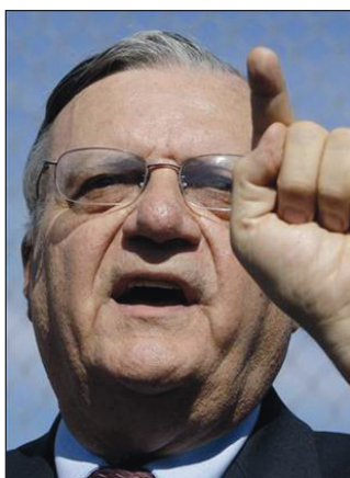
Maricopa County Sheriff Joe Arpaio

Arpaio in Phoenix in which protesters beat on the metal door of a jail and chanted, "Sheriff Joe, we are here. We will not live in fear."