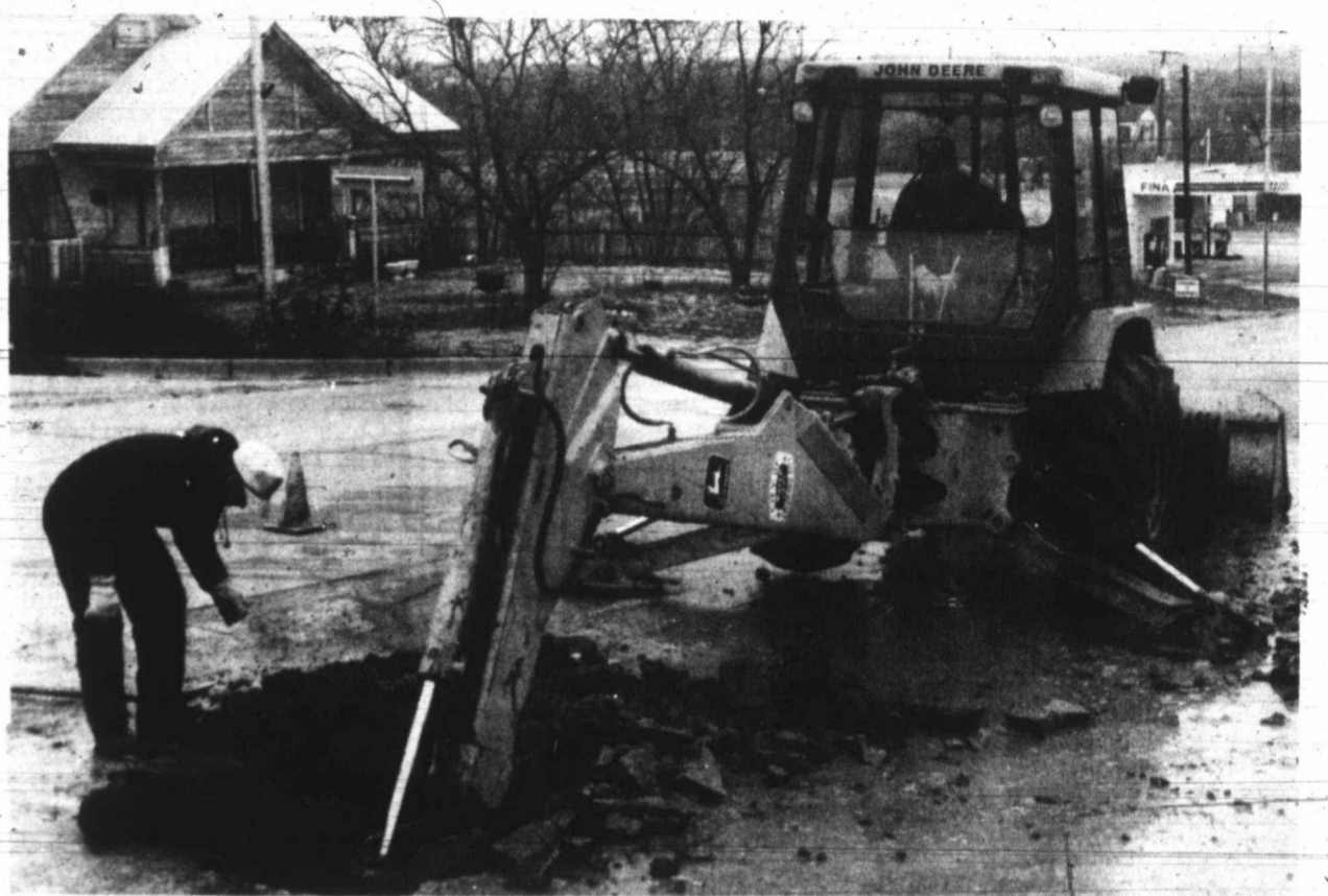
CITY WATER MAINTAINANCE EMPLOYEES WERE OUT IN THE COLD this week as they repaired several waterlines that broke because of the freezing weather. These waterlines are among those scheduled for replacement in the city's water and sewer project.