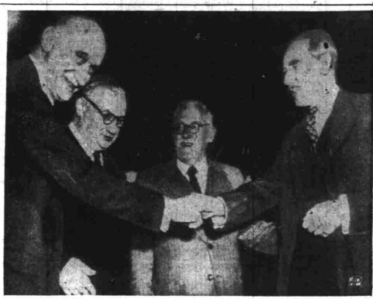
FAREWELL BUT NOT GOODBYE—It was time to say goodbye in Paris as the Big Four Council of Foreign Ministers adjourned its meeting. France's Robert Schuman (left) shakes hands with U. S. Secretary of State Dean Acheson (right) as Britain's Ernest Bevin (second from left) and Russia's Andrei Y. Vishinsky watch.