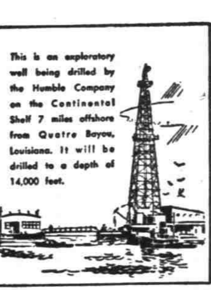
This is an exploratory well being drilled by the Humble Company on the Continental Shelf 7 miles offshore from Quatre Bayou, Louisiana. It will be drilled to a depth of 14,000 feet.

How deep is an oil well? . . . How long is a piece of string!