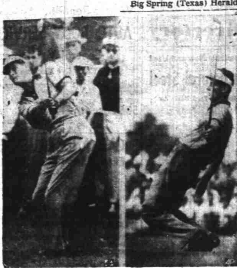
MIDDLECOFF PUTS BODY ENGLISH IN SHOTS—Dr. Carry Middlecoff, newly crowned National Open golf champion, attempts to help his ball as he applies body English after making shots in the Motors City Open at Detroit, Mich. He was co-winner with Lloyd Mangrum. At the left he tries to help his ball to the left as he approaches the fifth green in regular play and at right he tries to give his ball a push as it stops an inch from the cup on the third green in a playoff with Mangrum.

It'll be Graziano's first competitive appearance in the ring since Tony Zale took back the middleweight title June 10, 1948. Rocky had won the title a year previous from Zale.