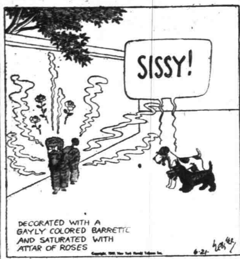
DECORATED WITH A GAYLY COLORED BARRETTIC AND SATURATED WITH ATTAR OF ROSES