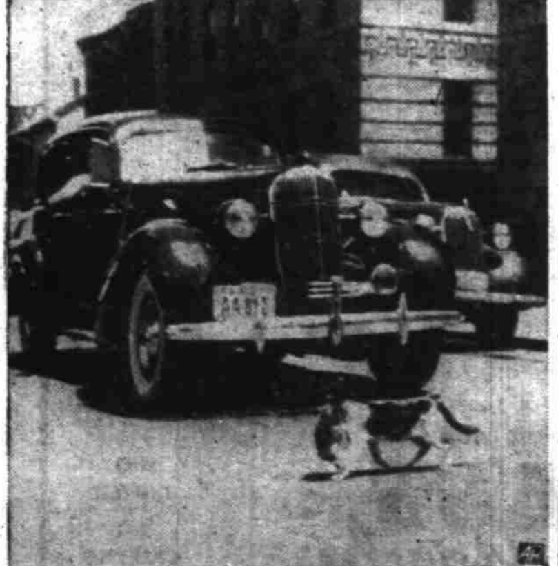
TRAFFIC HALTS — MINNIE MOVES—Traffic on Brooklyn's Webster Avenue halts as Minnie jaywalks across the street with one of her four new offspring.

Something over 80 percent of the croplands that were damaged by hail and winds recently have been reseeded to cotton again.