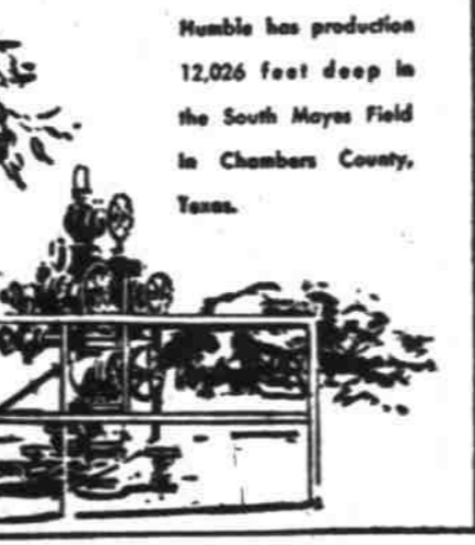
Humble has production 12,026 feet deep in the South Mays Field in Chambers County, Texas.