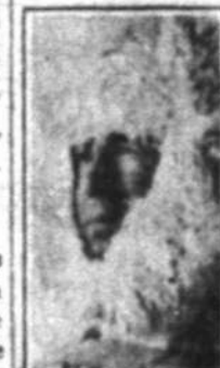
CAPT. G. H. WILKINS

A place never before seen by human eye because it is so hard to reach, the Ice Pole, 400 miles from the North Pole, will be passed over by Captain Geo. H. Wilkins next spring if his flight from Point Barrow in Alaska to Spitzbergen is a successful one.