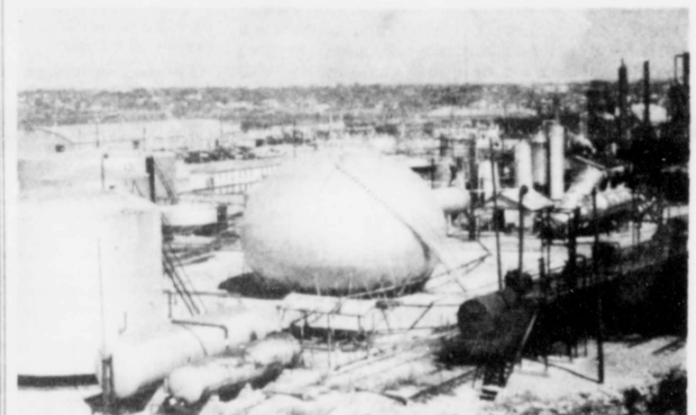
THE TWO PHOTOGRAPHS taken by Tom Jay Goss II show the Col-Tex Refinery during the late 1950's. The refinery was in operation until 1968. In the top picture, LIFE Magazine writer and photographer inspect the oil and gas seeping up from the ground across the refinery. LIFE Magazine went on to do a five-page spread on the once famous "Sunflower Field" which was adjacent to the Col-Tex Refinery.