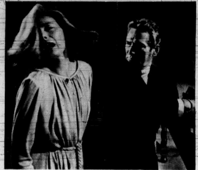
Coming to Palace

Colorado City Record, published twice weekly on Thursday and Sunday, entered as second class matter at the postoffice of Colorado City, Texas under the Act of March 4, 1879.