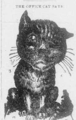
THE OFFICE CAT SAYS: Apollo is said to be the first man who ever struck a lyre. It's a pity he did not strike the rascal a little harder and thus save the present age from so many magnificent liars.

The man or woman who has time enough to keep up with every little whimsical piece of gossip about their neighbors, about their town, about anything, anybody and everybody—such a man or such a woman should enjoy our Christian sympathy. They are usually no good and perfectly harmless, yet their deplorable condition of mind should elicit our kindly feeling.