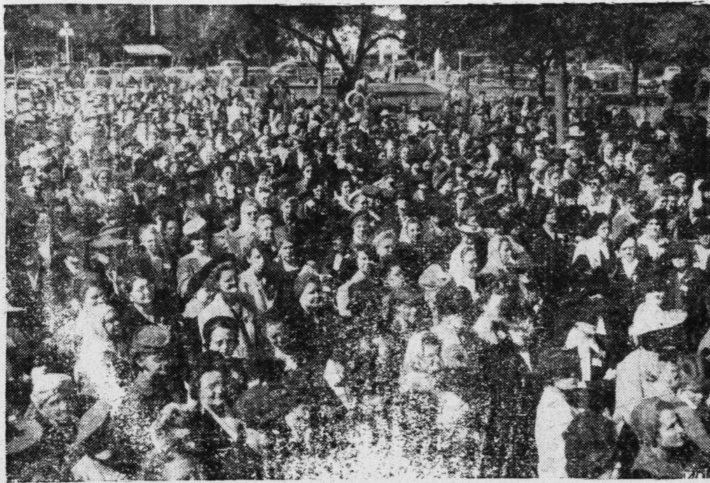
MOTHERS HONORED AT AMARILLO—Service mothers were paid high tribute by Gov. Coke R. Stevenson in an address on the courthouse lawn at Amarillo. A portion of the crowd is shown in the above photo. Gov. Stevenson declared that "mothers are making the greatest sacrifice in this war."