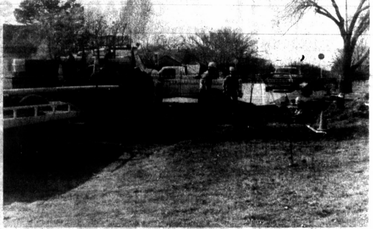
NEW LINE: Traffic was blocked off at 8th Street between Locust and Hickory Streets on Tuesday, as officials with Lone Star Gas Company laid a new polyethylene line.

She indicated that from the studies which Fina has made thus far, that a trench could be dug near the waterline and a wall placed perpendicular to the flow of the water. The wall would be made of a substance similar to PVC pipe. A series of 6 wells would then be installed on the up-gradient side of the wall to recover the contaminated fluids. The mixture would be pumped to a oil/water separator which would be installed on the property. The oil that would be separated, out would be held in a tank, then sent to the refinery in Big Spring. Water from the mixture would move to an evaporation pond. She noted that an engineering design of this plan would require TWC approval. The team of Fina representatives also included Ross Westbrook of Big Spring, employee relations. See FINA, page 2