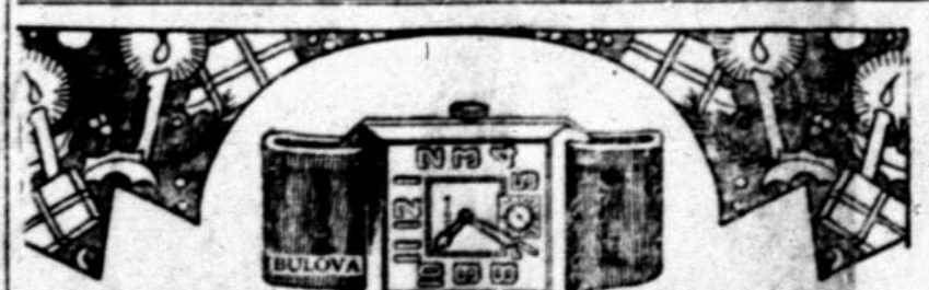
AMBASSADOR—A popular model at regular price, 14 karat gold $28.50 dial

The first form of telegraphy was invented in 1825 by Charles Wheatstone, in England, who also invented the concertina.