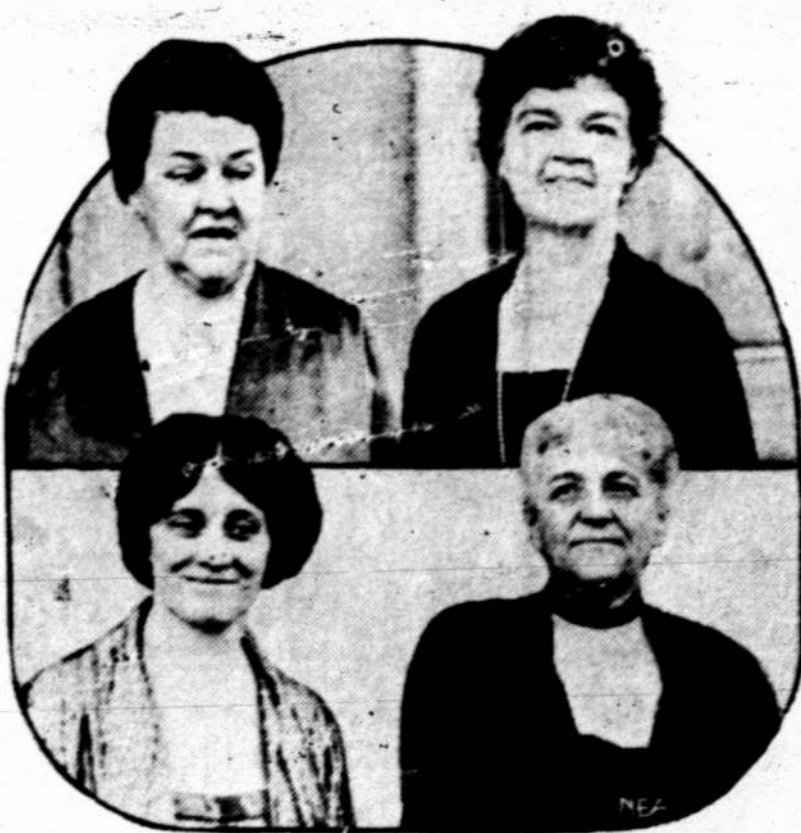
When the seventieth Congress opened the other day these four women took their seats in the House of Representatives. They are, left to right, top: Mary T. Norton, New Jersey; Mrs. Edith Nourse Rogers, Massachusetts; below Mrs. John W. Langley, new appointee from Kentucky, and Mrs. Florence P. Kahn, California.